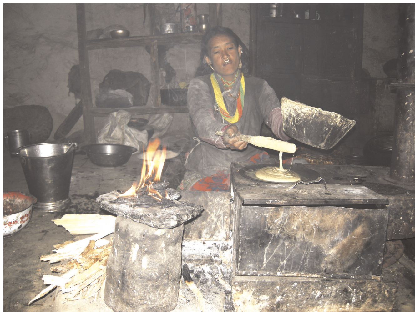
FIGURE 3 Woman preparing lakkad made from bitter buckwheat.

rice and boost cultivation of local grains, HDI promotes indigenous and nutritious foods such as lakkad (pancake made from bitter buckwheat) (Figure 3) and saatu (barley flour which is taken with Tibetan butter tea).