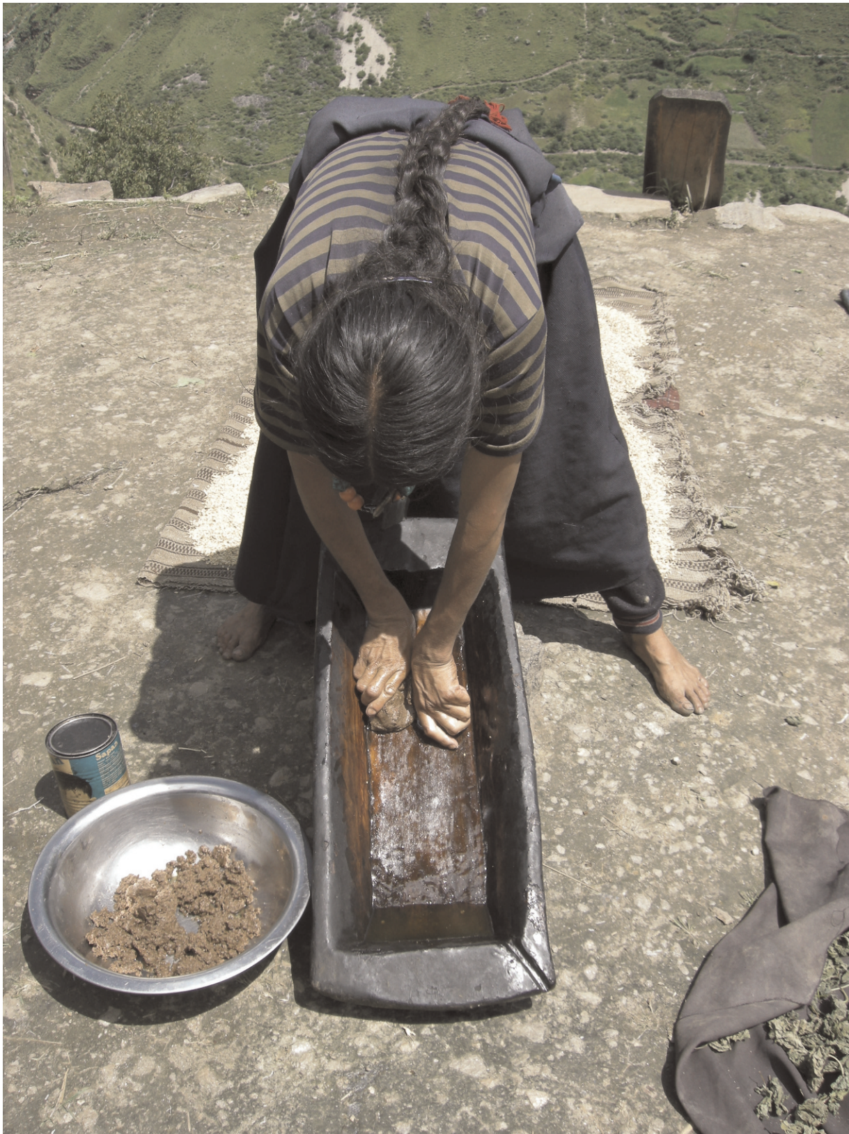
FIGURE 4 Manual extraction of oil from walnut kernels.