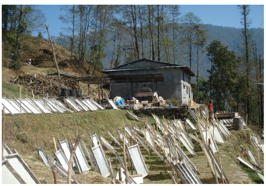
\begin{tabular}{ll} FIGURE 3 & Bhimeshower Handmade Paper enterprise situated at Boch, Dolakha. \\ \end{tabular}

In the case of Mahadevthan, district-level traders purchased NTFPs from the village traders and sold them to Kathmandu-based traders or enterprises. However, they did not do this regularly; therefore, the village traders did not buy them when there were financial constraints or a lack of demand. In such situations, trade in NTFPs could not take place.