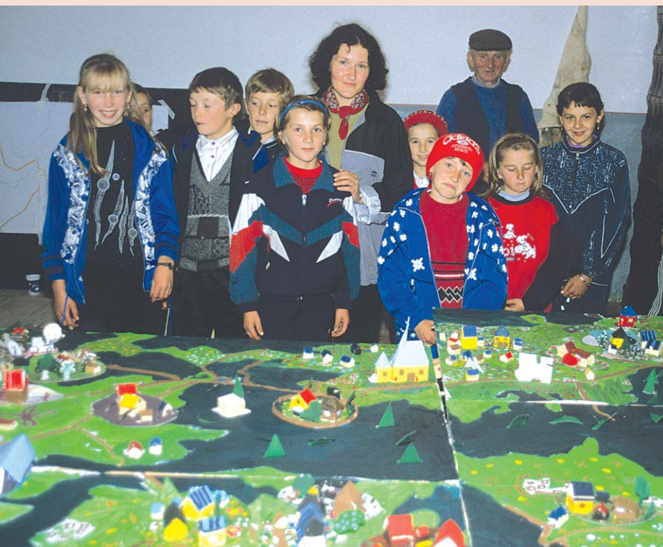
FIGURE 3 “Planning for real:” Ghețari pupils display their 3-dimensional vision of their village in the future. This model served as a tool for further discussion with their parents and other stakeholders.

financial instruments, and better marketing strategies are implemented. Successful regional development will be the most convincing argument in the transfer of results to other rural mountain regions of Eastern Europe.