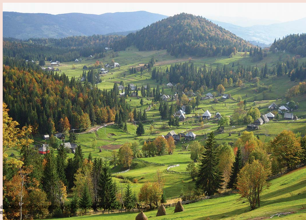
FIGURE 1 Landscape near Ocoale and Ghețari (1100–1300 m) in the Apuseni Mountains, characterized by dispersed settlements, grassland, and forest.

other activities including crafts, trade, and forestry, are their basic means of survival. Inhabitants have adapted their practices to the natural environment and have formed landscapes rich in structures, vegetation types, and species. The forests provide timber for construction and boards, firewood, wood pasture, berries, and mushrooms. The open land is dominated by meadows and pastures. Hay meadows are found on deeper soils. These are fertilized with manure and harvested manually using a scythe. Unfertilized grassland occupies the steeper and less fertile soils, mainly providing pasture.