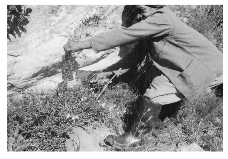
FIGURE 2 Harvesting of buchu.

majority of people questioned (87%) admitted that they had heard about concerns regarding the threat to wild buchu, including its imminent extinction. The respondents acknowledged that buchu harvesting in their area was indeed threatened, with 80% indicating that they noticed a decline in the amount available in the previous 5 years or so. However, contrary to prevailing wisdom among scientists and conservationists, according to which unsustainable harvesting practices are the major threat (Coetzee 1999; Hoegler 2000; CapeNature 2004), mountain fires topped the local list of threats, with 42% of the respondents agreeing (Table 1). This was followed by theft and unsustainable harvesting at 31 and 27%, respectively. Buchu poaching was observed to be less of a threat within Elandskloof. However, people admitted that there was occasional stealing, as well as a problem with people from outside using their local connections to come to the farm to harvest. According to local people, the scale of theft, however, is not of any major concern with regard to the sustainability of buchu. Regarding unsustainable harvesting as a threat, respondents argued that the frequency, amount harvested, and methods used for harvesting are important but of limited concern to them. However, almost all the respon-