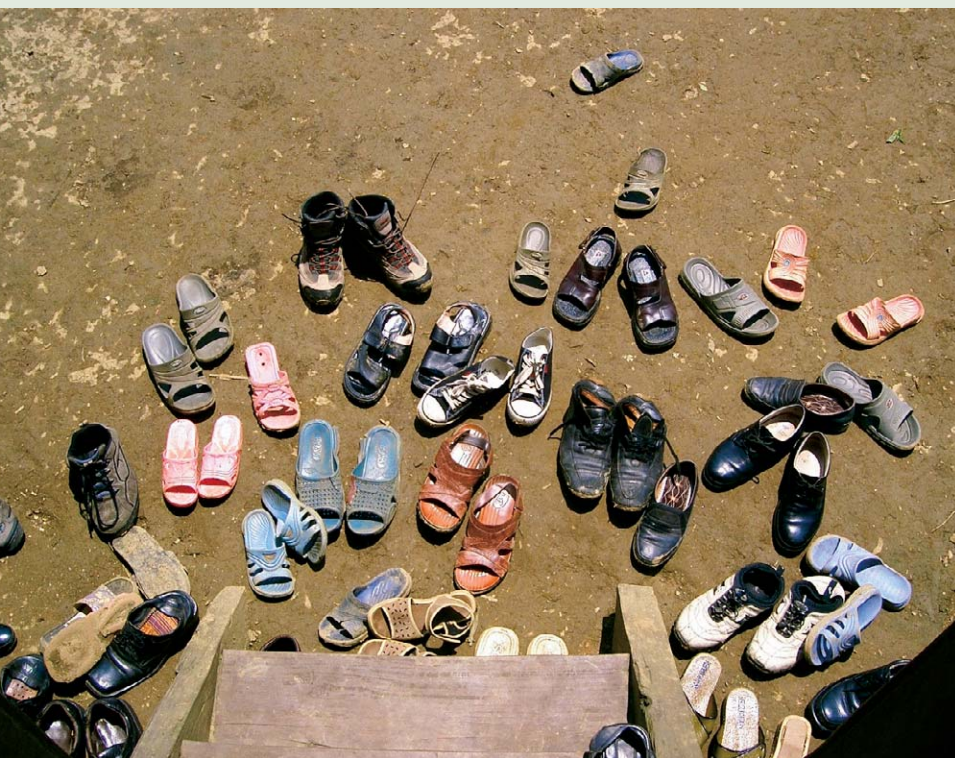
FIGURE 2 Participation as a key element: these shoes testify to the diversity of participants in a village meeting on benefit-sharing. (Photo by Hans Schaltenbrand, 2006)

and extension approaches are tested in selected partner provinces across the country. Experience gained in pilot implementation is fed into the national policy dialogue, ensuring that local initiatives are backed up by appropriate long-term policies.