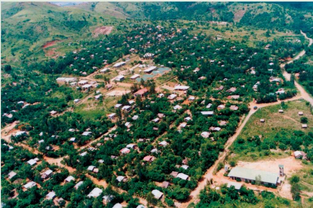
FIGURE 3 The Cawag resettlement center, where Aetas who were victims of the 1991 Mt Pinatubo eruption found refuge. (Photo courtesy of the Mount Pinatubo Commission, mid-1990s)

Changes have concerned components of the Aeta social fabric exposed to these interactions. Table 1 shows that these changes include settlement patterns, religion, language, medicinal treatments, clothing, diet, land tenure, and farming activities. On the other hand, some of the fundamentals pertaining to relationships within the society, notably a “communal” sense (eg groups of 2 to 3 Aeta households still co-exploit swiddens, share food, and journey together to the public markets for economic transactions) and kinship patterns (eg traditional weddings still involve a 3-stage procedure which includes the formal proposal, the very important negotiation of bridewealth, and