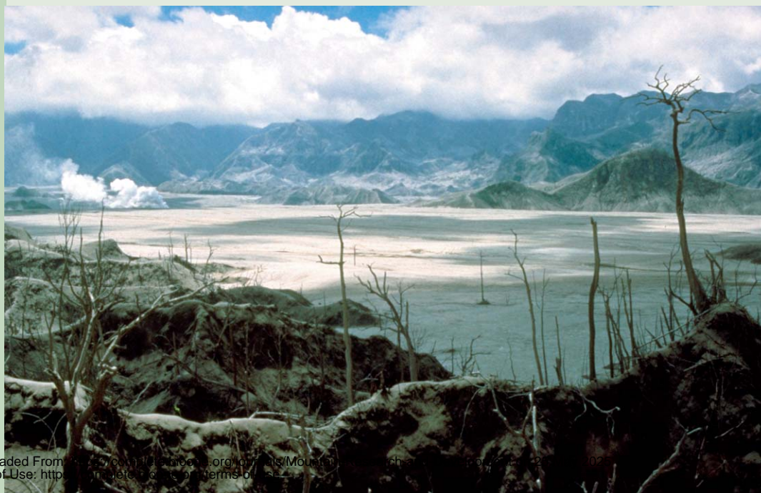
FIGURE 1 View to the northeast across pyroclastic-flow deposits and a fumarole in the Marella River valley toward Mt Pinatubo. The vegetation in the foreground has been stripped and charred by ash-cloud surges of pyroclastic flows.

of the eruption on 15 June that affected even the town inhabitants, the authorities once again had to transfer many Aeta families to evacuation centers much farther from their villages. Inside overcrowded school buildings, gymnasiums, churches, and tent camps, nutrition problems and diseases (pneumonia, measles) spread quickly, taking a heavy death toll among Aeta children. Faced with the impossibility of sending the Aetas back to their former villages, which had been buried under meters of volcanic deposits, the Philippine government eventually had to plan a permanent resettlement program. By June 1991, the authorities had created eleven upland resettlement centers intended primarily for the Aetas. In these centers, each family was allocated a lot measuring 150 m 2 and traditional