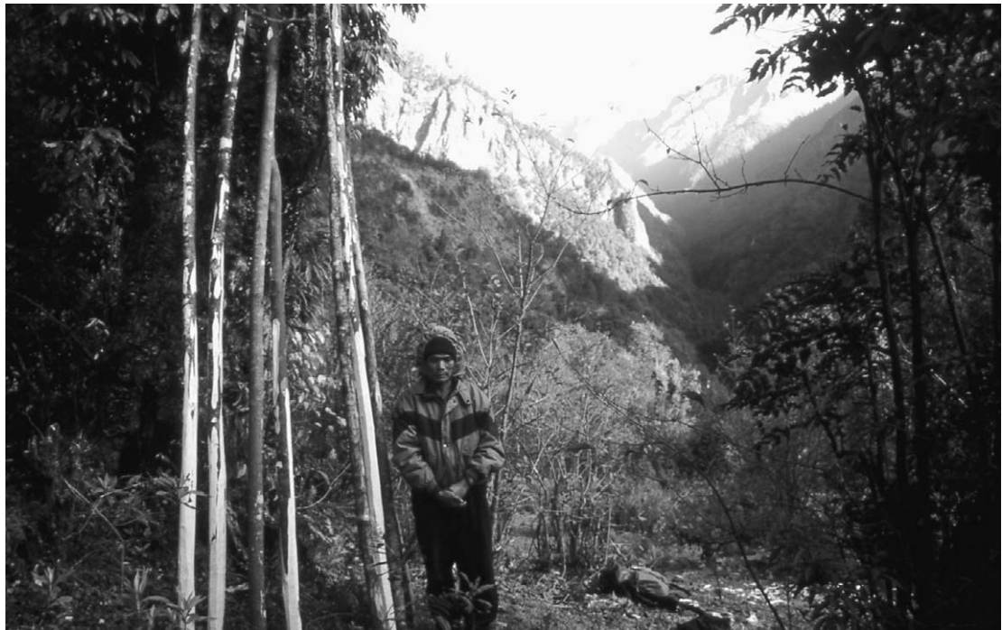
FIGURE 3 Field assistant Bo Bahadur Thapa beside harvested poles.

diameter, 2–3 m long) placed at 3 heights across the wall, and posts and beams ( kaamo and bolo ; ~8–10 cm diameter and 2–3 m long) that support the roof of woven bamboo mats. After tying crossed poles with strips of split bamboo, herders fill in the wall framework with leafy tree branchlets or the leafy tops of bamboo stems. Because the small wall and fence vertical members were harvested from the sapling size class and from coppice stump regrowth in the shrublands surrounding agricultural fields, we based our estimate of pole-size tree harvest for goTh construction on the average requirement for medium and large poles.