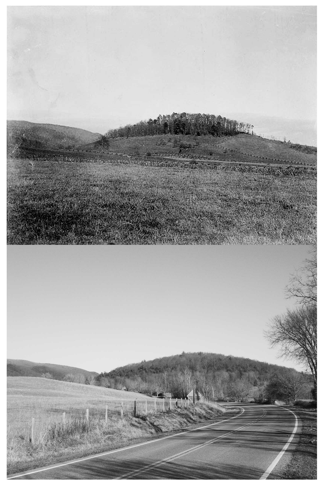
FIGURE 1 Repeat photographs from Walker's Creek near White Gate, Virginia. The top photograph was taken in 1880 and the bottom photograph in 2008. The hill in the background represents the conversion of higher elevation agricultural lands to forest.