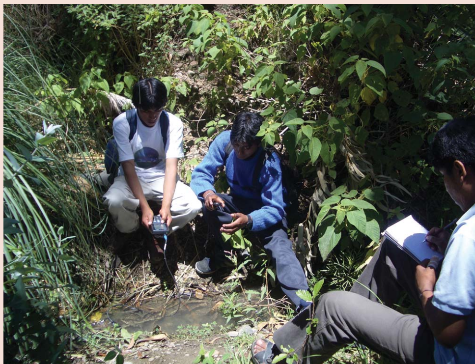
FIGURE 2 Water quality sampling, Tiquipaya, Bolivia.

A fundamental component of working on water-related issues in Bolivia is the socialization of projects with local communities and water user committees. After several town meetings and discussions with the irrigation users' committee, both communities agreed to support the project and youth groups were formed in the upper and lower watershed. Diagnostic workshops were conducted with local youth to discuss water issues in both communities and to design research questions that could help to solve those issues (Table 1). Activities were specified and undertaken in the 2 zones, including water source mapping, wetland coring, and greenhouse vegetable production in the upper watershed; water rights' analysis, computing and mapping of distribution systems in