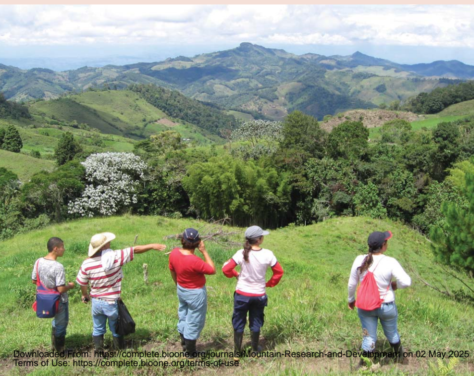
FIGURE 3 Research theme diagnostic, Génova, Colombia.

In parallel with the research process, workshops for the development of leadership skills were conducted. They focused on self-awareness, group affiliation, self-