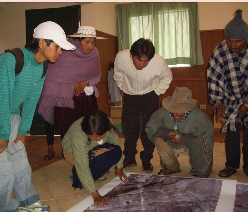
FIGURE 5 Participatory water source mapping, Cordillera of Cochabamba, Bolivia.

this project to generate and disseminate knowledge about the state of local natural resources and about water as a critical resource for improving livelihoods. Through the generation of local knowledge and acquired communication skills, projects were formulated to improve resource management in the micro-catchments. Issues related to water availability, water pollution, and water use were quantified by local youth, and mitigation options were investigated with local water users (Figure 5). Young researchers gained valuable analytical skills and an understanding of pollution issues in their communities, which they were able to communicate and use to initiate behavioral change.