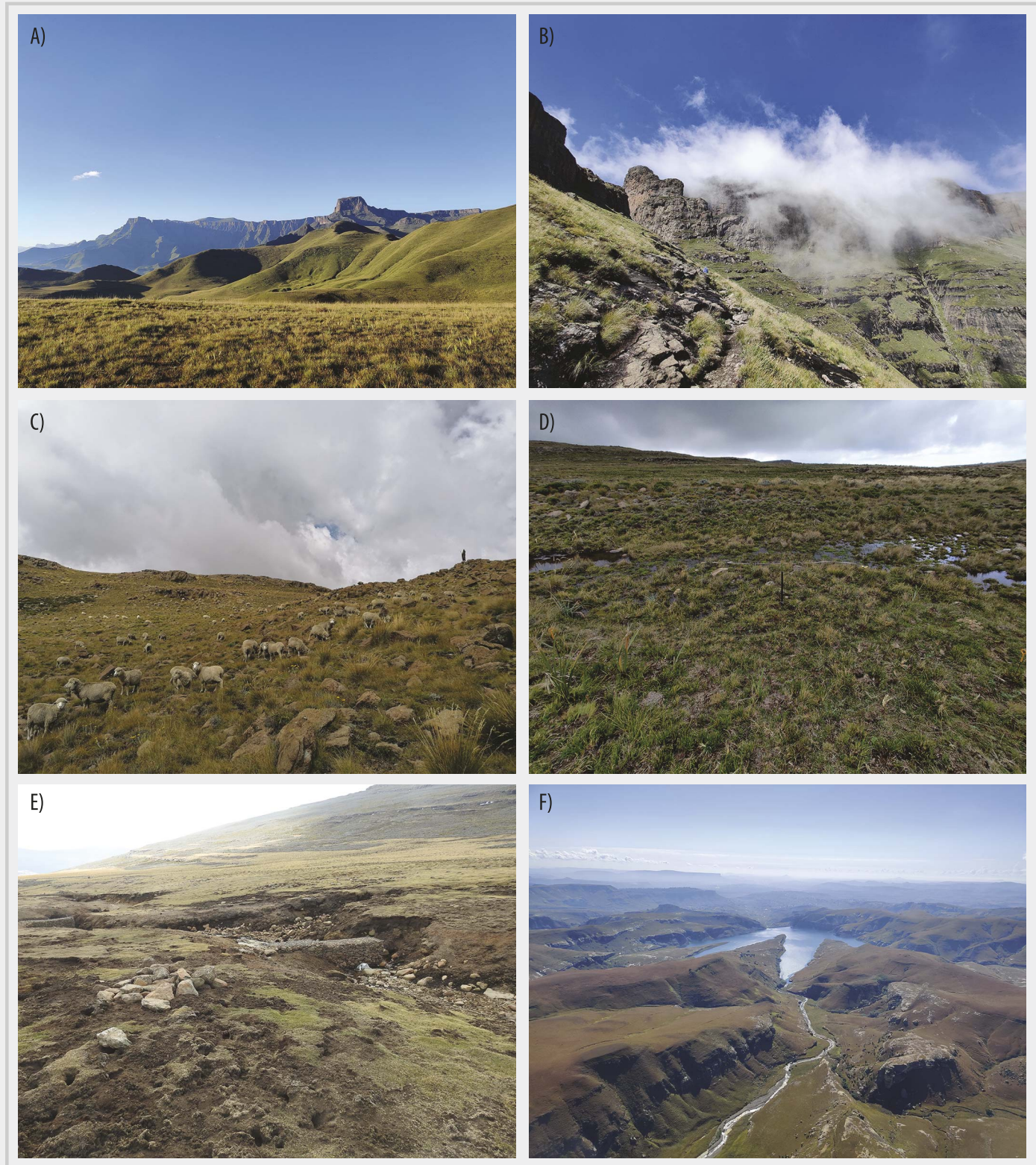
FIGURE 2 Views of (A) the Amphitheatre from Witsieshoek and (B) Sentinel Peak hidden in the clouds, photographed during a hike to the summit area. (C) A herder watching over a flock of sheep grazing on the alpine grasslands. (D) Well-preserved alpine wetlands. (E) Severely degraded alpine wetlands. (F) View from the Amphitheatre summit area over the Fika-Patso Dam.

Assessment, GEO Mountains and the Mountain Research Initiative, and the Global Observation Research Initiative in Alpine Environments. The first sister LTSER area to the Mont-Aux-Sources LTSER platform will be the