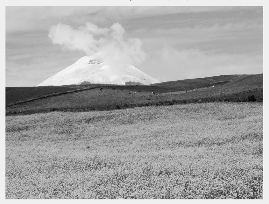
FIGURE 2 A field of canopy grass at the foot of Cotopaxi Volcano in Ecuador is one of the places where CONDESAN's Andean Paramo Initiative is being implemented.