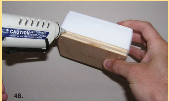
Figure 4A. The pipet tip box is placed over a piece of \frac{3}{4} " plywood cut to size. 4B. It is secured in place with hot glue.

Connect a length of rubber tubing from the regulator on a CO 2 tank to the aquarium valve using polypropylene connecting tubes as needed (Figure 1). Run plastic tubing from the aquarium valve to individual platforms. In some cases, a fitting reducer is needed if the CO 2 tank valve and the aquarium valve are different sizes. We color code the aquarium valve and platforms with colored tape so we can quickly identify which valve feeds which platform. Adequate CO 2 flow exists if you can feel the gas lightly diffusing through the platform with the back of your hand or if you hear it lightly hissing if you hold the platform next to your ear. If the flies are visibly moved by the gas diffusing through the platforms, the flow may be too high. Conversely, if flies resuscitate and begin to walk around, adjust the valve to increase the flow of gas which should immediately immobilize them. Once the gas level is set, the platforms may be placed under dissecting microscopes for observation and manipulation of Drosophila .