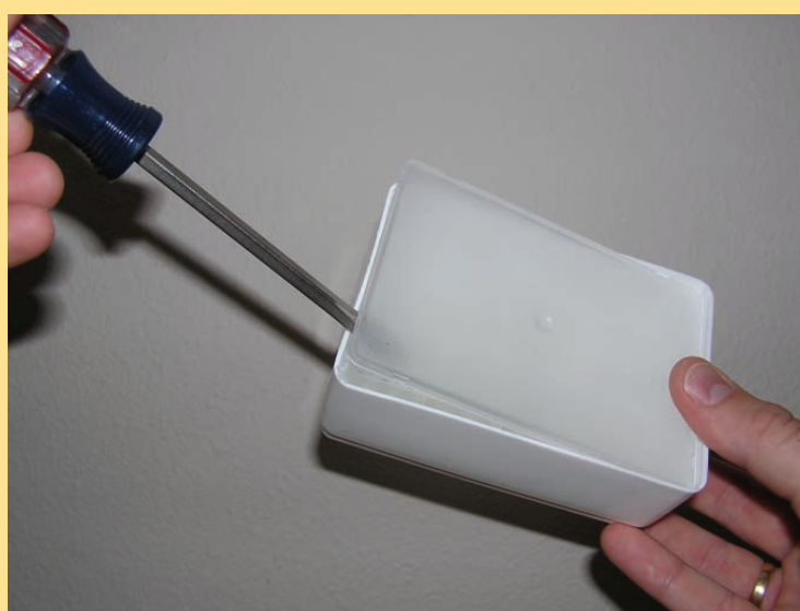
Figure 2. The base of the pipet tip holder is removed with a flat-head screwdriver.