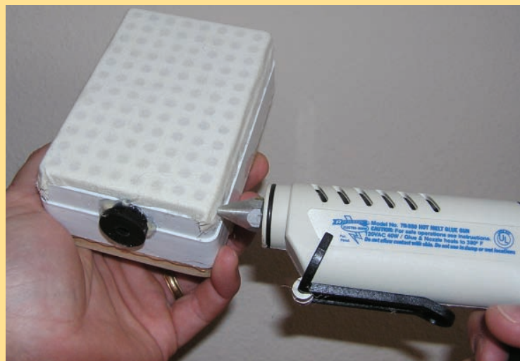
Figure 5. White felt or similarly porous fabric is placed over the top of the pipet tip box and secured around the edges with hot glue.

Drosophila in culture tubes or stock vials must be anesthetized before they are transferred to the staging apparatus. First remove the tubing from the rubber stopper on one of the stages. Carefully invert the culture tube or stock vial so anesthetized flies don't fall into the culture medium, insert the rubber tube