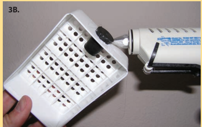
Figure 3A. A \frac{3}{4} " hole is drilled in the side of the pipet tip holder. 3B. The rubber stopper is inserted and secured with hot glue.