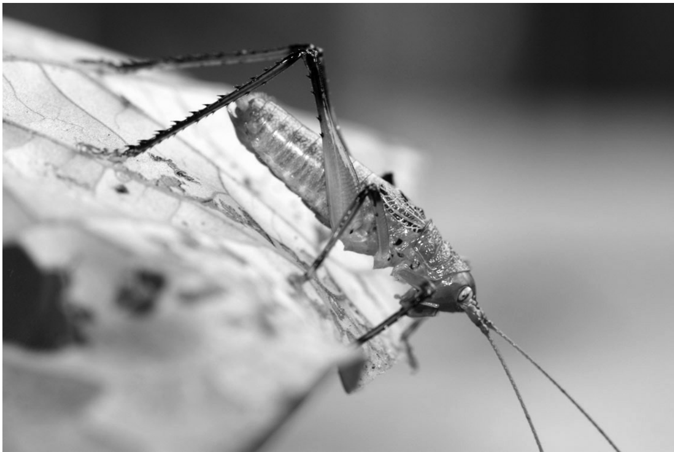
Fig. 2. Male (individual cbt017s06). For color version, see Plate III.