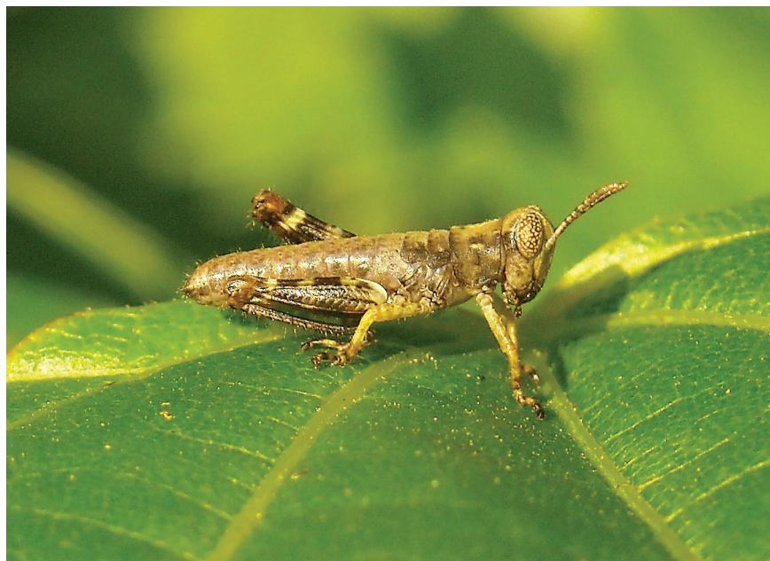
Fig. 2. Second instar Melanoplus punctulatus , photographed on July 17, 2014 at Chadron State Park, elevation ~ 1060 m above sea level.

On September 2, 2014, we surveyed Monroe Canyon in Sioux County, Nebraska, which is about 80 km (50 miles) west of Chadron, Nebraska. Despite searching the trunks of over 50 green ash trees during ~ two hours, no M. punctulatus were found. Thus, Dawes County may represent the westernmost limit of M. punctulatus in Nebraska.