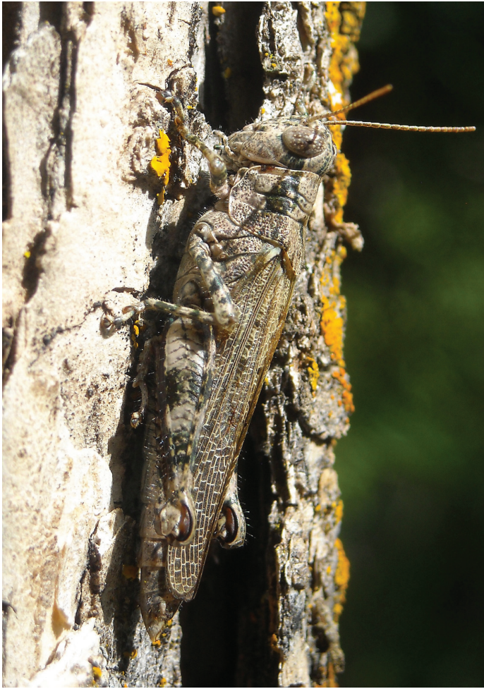
Fig. 3. Female Melanoplus punctulatus photographed at Chadron State Park on bark of green ash.

On October 14, 2014, we returned to Chadron State Park. By this date, the green ash trees had lost virtually all of their leaves. During a 30-min walk, 12 males and two females were collected and three additional females were observed, all adult. All were found on the ground, mostly along the edge of a trail. Two additional adult males were collected on October 18, 2014, along the same trail. A single adult male was also collected by H. R. Lawson on his garage door on the morning of October 15, 2014, approximately two miles east of Chadron near Little Bordeaux Creek. For a full listing of specimens collected and observed, see Table 1.