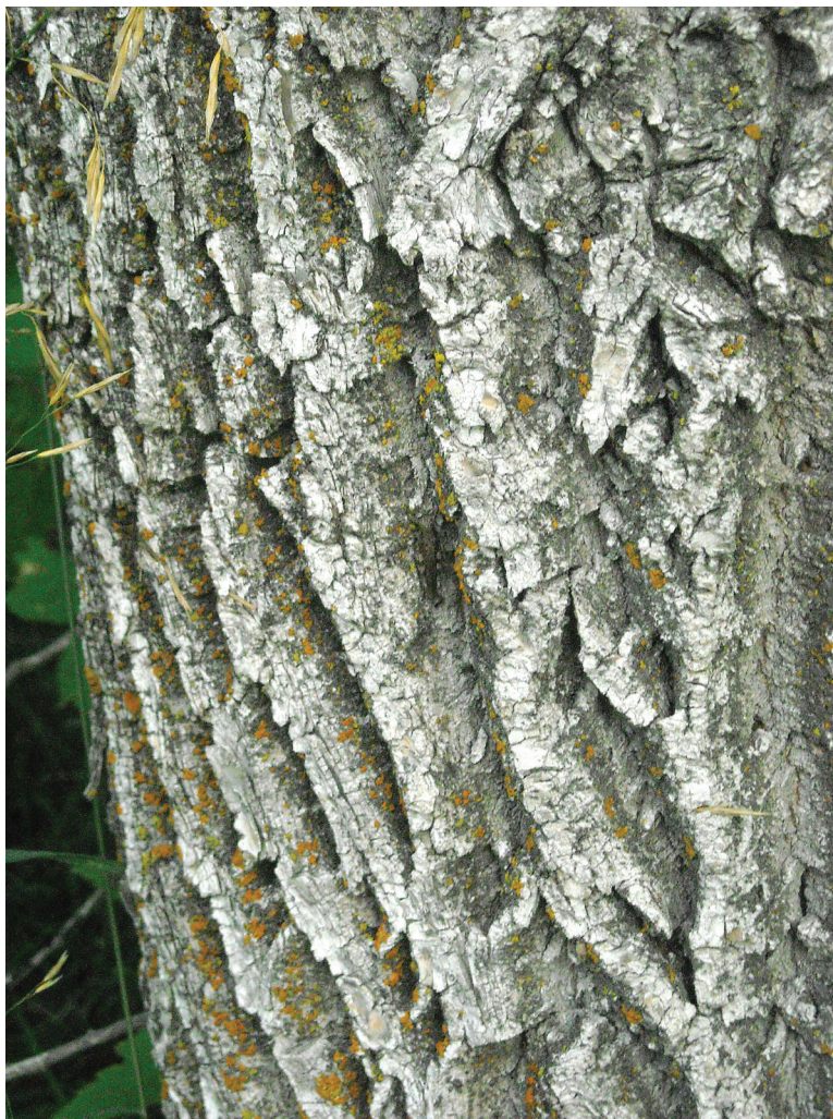
Fig. 6. Female Melanoplus punctulatus photographed at Chadron State Park on bark of green ash. Individuals are extremely cryptic when on this substrate. Female is located at exact center of figure.