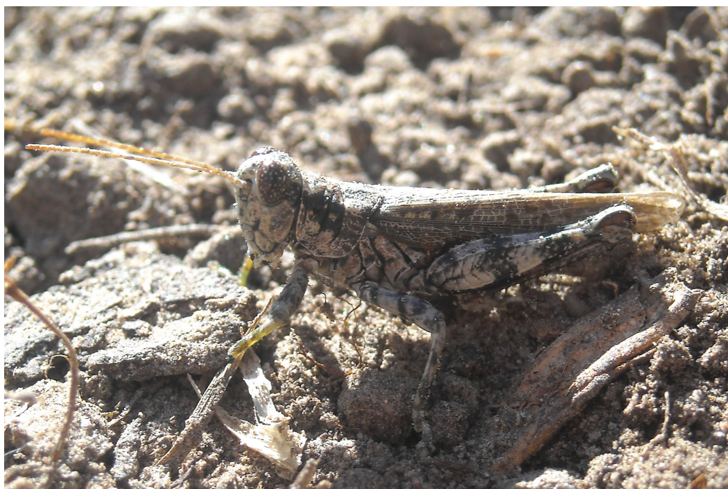
Fig. 5. Male Melanoplus punctulatus photographed on soil of campground trail at Chadron State Park.

ash throughout the Great Plains, or if it associates with other plant species. The specimen from Richardson County in 2008 was collected from the trunk of an oak ( Quercus sp.) tree (Brust et al. 2008), and we found them on hackberry and wild grape (see above).