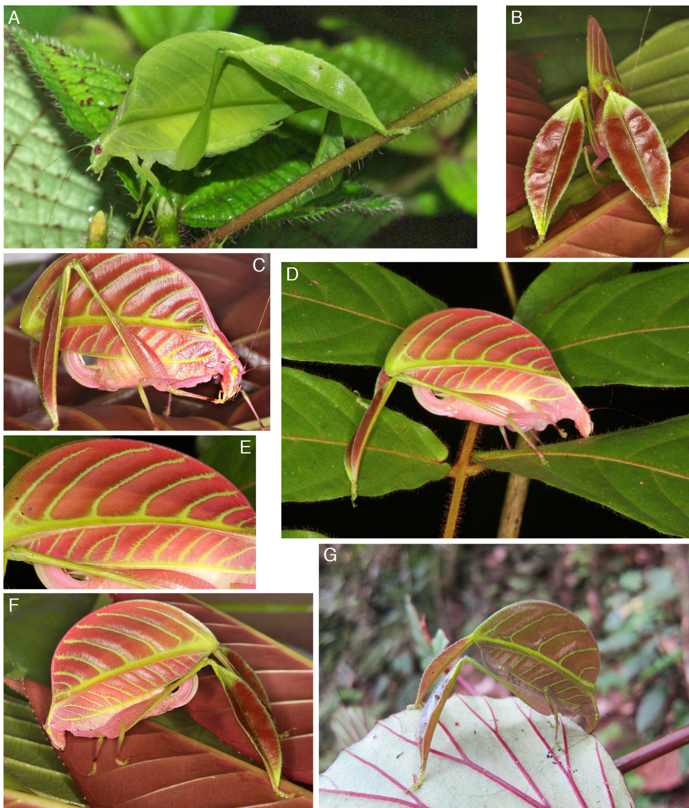
Fig. 3. Eulophophyllum species in habitat (A, D, G) and sitting on red leaves (B-C, E-F): A, E. kirki sp. n. male (Danum); B-E, E. kirki sp. n. female (Danum); G, E. lobulatum sp. n. female (Kinabalu). – A, C, E, G, lateral view; B, apical view of hind legs and ovipositor; D, oblique lateral view. For color version, see Plate III.