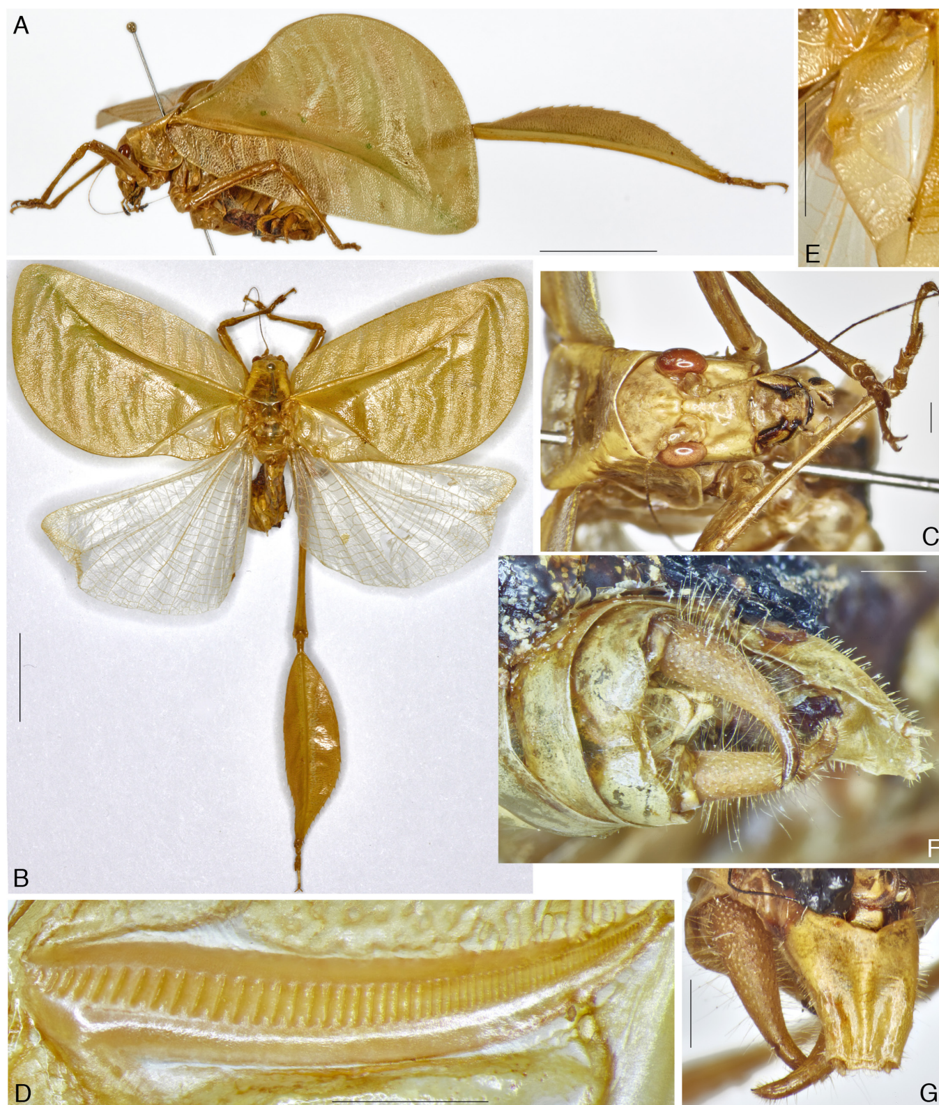
Fig. 2. Eulophophyllum lobulatum sp. n. male (holotype): A, lateral view original setting; B, dorsal view after spreading wings of both sides; C, frontal view of head, pronotum and fore legs; D, stridulatory file on underside of left tegmen; E, stridulatory area of right tegmen; F, abdominal apex dorso-apical view; G, subgenital plate and cerci ventral view. Scales 10 mm (A-B), 1 mm (C-D, F-G), 5 mm (E). For color version, see Plate II.