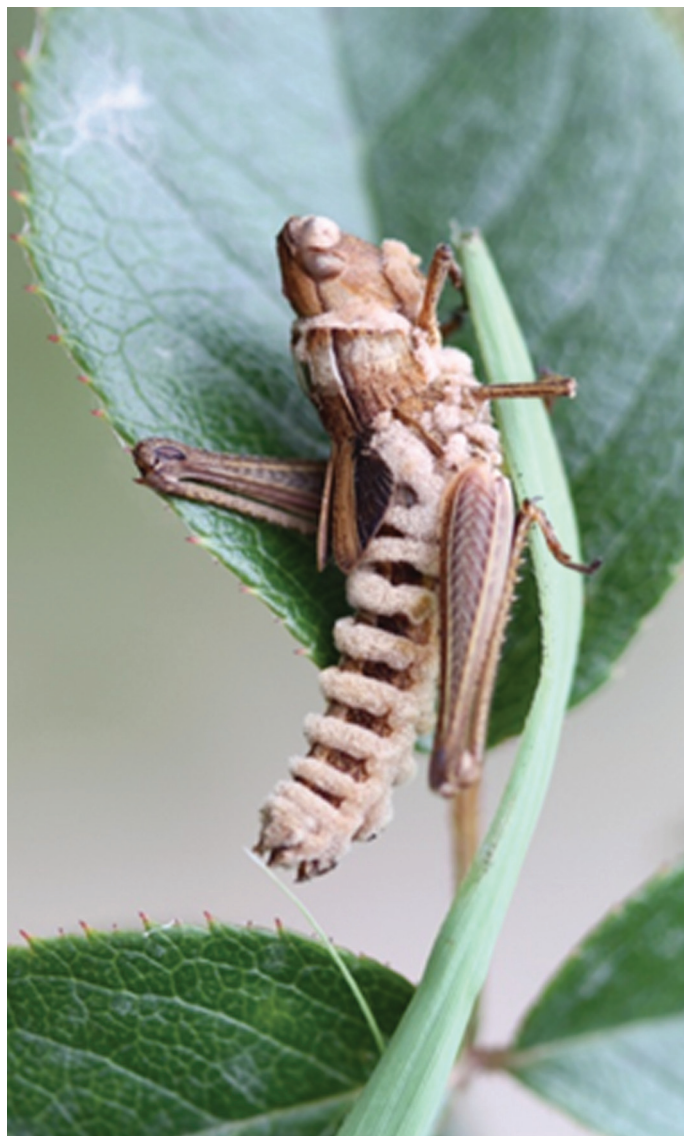
Fig 1. Chorthippus angulatus killed by Entomophaga grylli in Kazakhstan.

all of Kazakhstan. In most cases the dead insect collections were made in the areas of high-density grasshopper and locust populations and known disease occurrence. Dead insects exhibiting the "summit disease" signs were collected mostly from the stems of various plants, placed into plastic or glass vials sterilized with 70% EtOH, and stored at +4°C for subsequent examination. In case there was no visible mycelium on the insect body, the specimens were placed into a "wet chamber" until the sporulation started. The "wet chamber" represented a Petri dish bottom with a round piece of filter paper soaked with distilled water and closed with a Petri dish lid (Evlakhova & Shvetsova 1965, Issi et al. 1993). Identification of the pathogen was done by examining the conidia under the microscope MBI-15 (magnification 40× and 90×), measuring the spore size by an ocular micrometer MOB-1-15×, and following the keys of the "Guide to entomophilous fungi of the USSR" (Koval 1974).