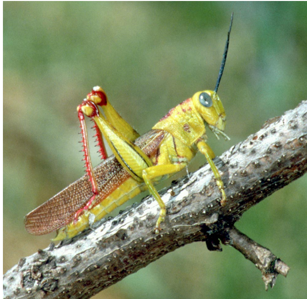
Fig. 1. Male Bryophyma debilis fledgling.