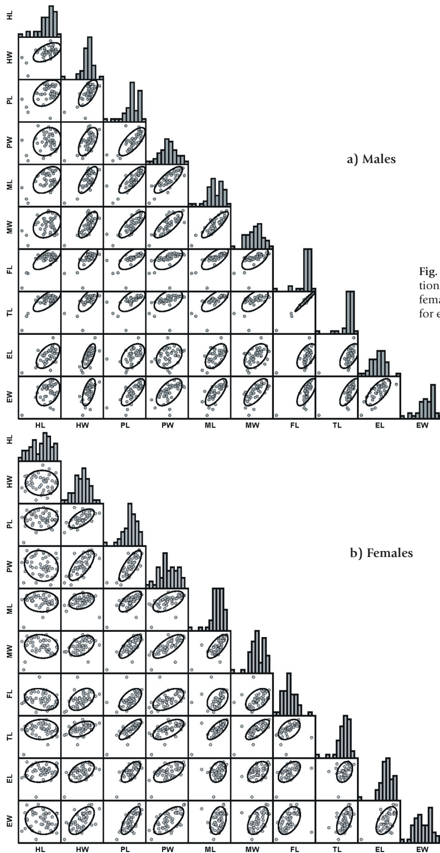
Fig. 1. Histograms and scatterplots, Pearson correlation matrix for the nonsize-adjusted a) male and b) female, morphological traits. See Methods section for explanation of variables.