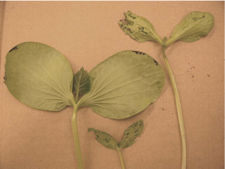
Figure 4. Photograph of squash (‘Turks Turbin’) (top left), cucumber (‘Marketmore 76’) (bottom center), and pumpkin (‘Magic Lantern’) (top right) plants from the laboratory no-choice feeding study. Note the decrease in cotyledon size and increase in intensity of Cerotoma trifurcata feeding damage from squash to pumpkin to cucumber. Damage to each plant was caused by ten C. trifurcata adults over 72 h.

squash plants, with pumpkin plants having an intermediate amount of damage (Table 1; Fig 4; 5). The percentage of plants with stem damage was significantly greater for cucumber and pumpkin plants compared to squash plants ( F = 5.00 , df = 2, 15 , P = 0.022 ), while the percentage of plants with damage to the first true leaf did not differ significantly ( F = 0.83 , df = 2, 15 , P = 0.45 ) (Table 1). Significantly more cotyledon area had distinct holes on cucumber plants than pumpkin or squash plants ( F = 11.88 , df = 2, 15 , P = 0.0008 ) (Table 1). The percentage of the lower ( F = 16.86 , df = 2, 15 , P = 0.0001 ) and upper ( F = 9.21 , df = 2, 15 , P = 0.0025 ) surface of the cotyledons scarred for cucumber and pumpkin plants was significantly greater than that of squash plants (Table 1).