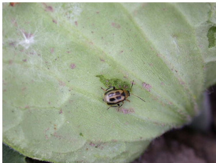
Figure 2. Photograph of an adult Cerotoma trifurcata on a pumpkin ('Magic Lantern') cotyledon with associated damage. Image was taken in a commercial pumpkin field near Rosemount, MN, 13 June 2003.