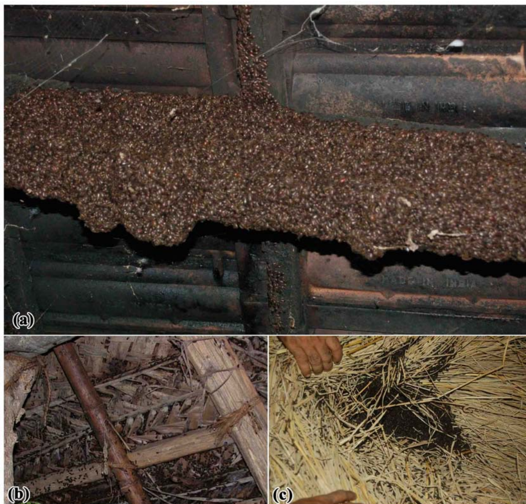
Figure 8. Aggregated dormant beetles settled on (a) wooden frames of tile roofed buildings (b) thatched sheds made of coconut fronds and (c) hay stack in cattle shed.

to reports in S. rotundus (Wolda and Denlinger 1984). How and why they maintain flight ability and flight muscles during dormancy, which is costly, and energy consuming remains unanswered? We suggest that, unlike in diapause, degeneration of flight muscles and loss of flight capacity may not be taking place during oligopause.