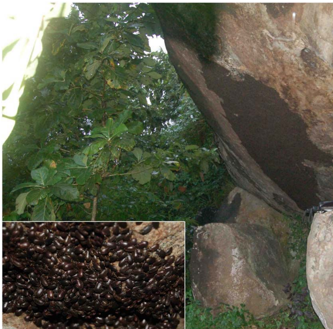
Figure 2. Natural aggregation of L. tristis below boulders.

based on studies in both nature and laboratory conditions are provided. Environmental conditions during diapause profoundly influence its duration and therefore it is erroneous to relate laboratory derived data to field situations in studies involving diapause (Tauber and Tauber 1976). Hence, we conducted experiments under laboratory and field conditions and monitored the activities of aggregations settled in natural conditions. These details may assist in the development of efficient strategies for controlling the population build up of L. tristis by the efforts of scientific community and rubber planters, and provide additional data on the biology and ecology of this species.