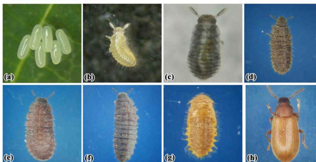
Figure 3. Early developmental stages of Luprops (a) egg mass (b) 1 st instar larva (c) 2 nd instar (d) 3 rd instar (e) 4 th instar (f) 5 th instar (g) pupa and (h) teneral adult.

hatchability, duration and mortality of larval, pupal and adult stages were recorded. Longevity was estimated as the sum of means of larval, pupal and adult durations.