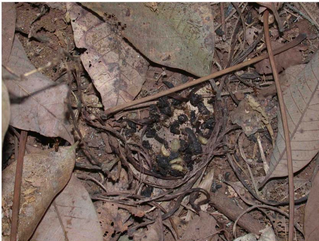
Figure 6. Cluster of V th instar larvae in a quiescent state prior to pupation and newly emerged pupae in the litter floor of rubber plantation.

below litter diurnally and were surface active nocturnally.