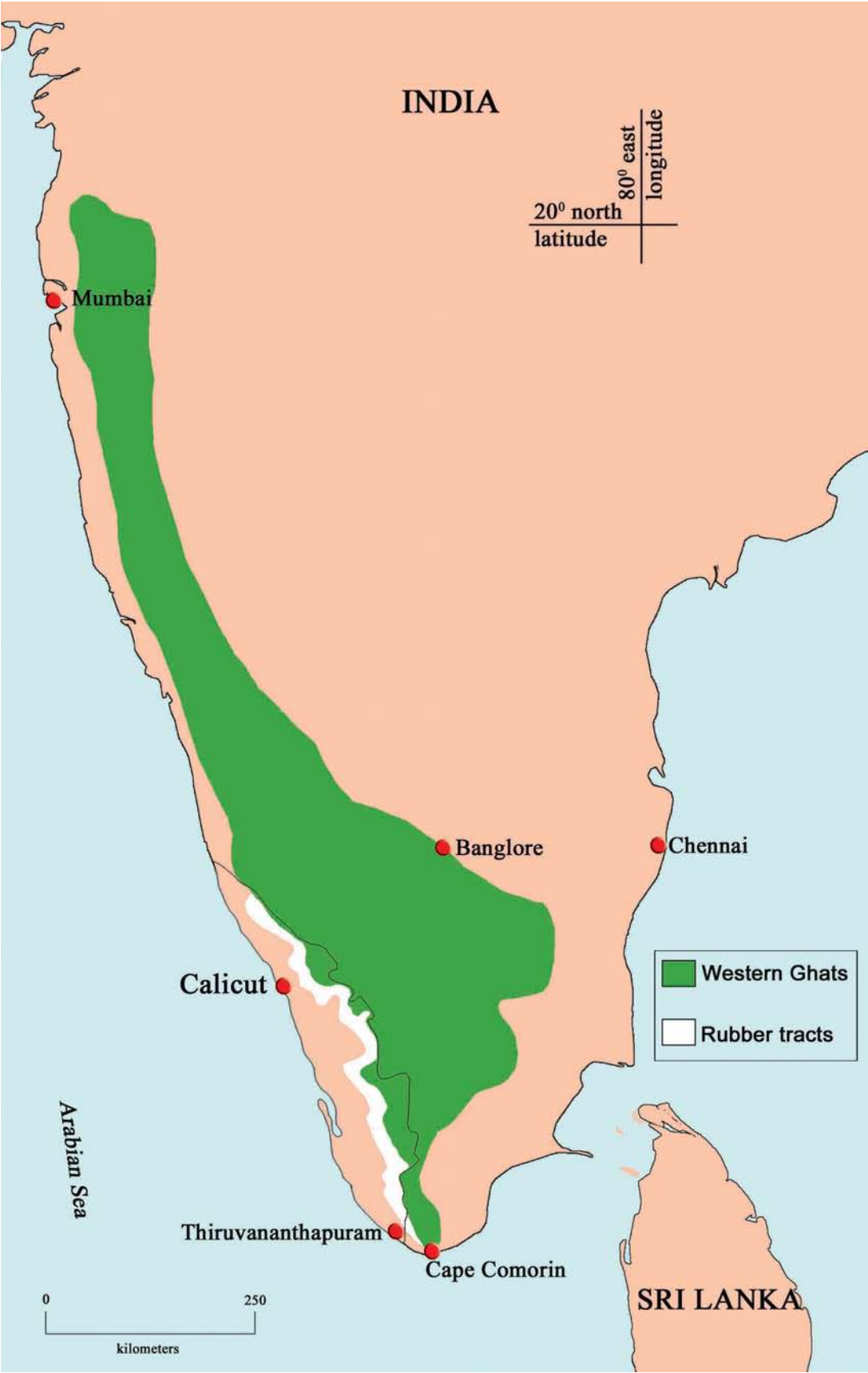
Figure 1. Rubber plantation tracts in the western slopes of south Western Ghats in south India.