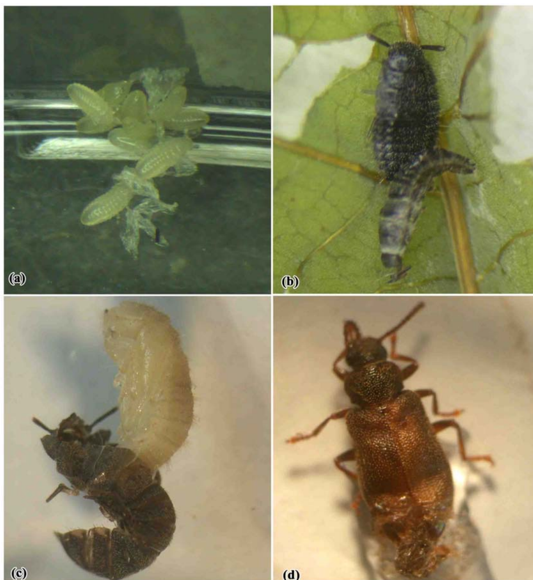
Figure 5. Egg hatching (a), eclosion of larva (b), pupa (c), and teneral adult (d).

dry leaves and on the mesh net topping of vials in laboratory setups. In the field, eggs were present in middle litter layers of the plantation litter, possibly to protect eggs from desiccation because of their high surface to volume ratio and inability to replace lost water during the dry season (Denlinger 1986). Eggs were laid daily or at intervals of 2–3 days. Oviposition was generally a nocturnal event except for a few incidences ( n = 6 ) during the daytime in laboratory setups. Eggs are elongate, oval, creamy white, sticky and very delicate, measuring 1 \pm 0.06 mm ( n = 100 ) in length with a distinct concave anterior pole and a convex posterior pole. The average fecundity of female was 30.6 \pm 13.92 eggs ( n = 30 ). The lowest recorded fecundity was 12 and the highest was 60. The average oviposition period was 6.1 \pm 2.41 days ( n = 30 ).