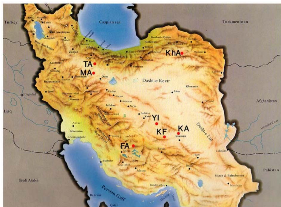
Figure 1. Distribution of collecting sites. See Table 1 for the codes.