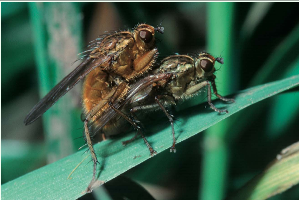
Figure 1 Copulating pair of S. Stercoraria . High quality figures are available online.

probably a closely related sister species, S. soror (Werner et al. 2006). It is not reported from anywhere else in the southern hemisphere. In North-Central Europe, S. stercoraria is one of the most abundant and widespread insect species associated with cow dung, although some similar scathophagid species may co-occur on cattle pastures, depending on location, but usually at much lower densities (e.g. S. furcata in North America and S. inquinata , S. suilla , and S. lutaria in Europe). The species' distribution pattern is likely influenced by human agricultural practices. While S. stercoraria is considered a cow-dung specialist, it can successfully breed on dung of other large mammals such as sheep (Hirschberger and Degro 1996), horse, deer, or wild boar (Blanckenhorn et al., unpublished data).