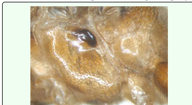
Figure 3. Laxiareola ochracea , Mesopleuron. High quality figures are available online.

raised, and touching mesopleural suture. Around mesopleural fovea smooth and lucent. Sternaulus very weak, about half as long as mesopleuron. Metapleuron smooth, upper-anterior portion with fine and indistinct punctures. Submetapleural carina complete and strong. Wing gray-brownish hyaline. 1cu-a distad of 1-M, distance between them about 0.3 length of 1cu-a. Areolet absent. Vein 2rs-m basad of 2m-cu, distance between them about 0.7 length of 2rs-m. Vein 2-Cu 0.5 times as long as 2cu-a. Hind wing vein 1-cu strongly inclivous, about 4.6 times as long as cu-a. Apical edge of first trochanter of leg with a small tooth on the outer side. Apex of front tibia with a small tooth. Tarsal claws pectinate. Propodeum (Figure 4) completely areolate, dorsal profile (from base to posterior transverse carina) about 0.38 length of propodeum, posterior profile strongly sloping. Area basalis distinctly wider than long. Area superomedia approximately 1.8 times as wide as long, its lateral carinae weak. Area basalis and area superomedia with irregular wrinkles.