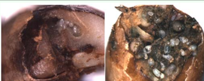
Figure 2. Hypothenemus hampei galleries containing eggs (left), and eggs and larvae (right). High quality figures are available online.