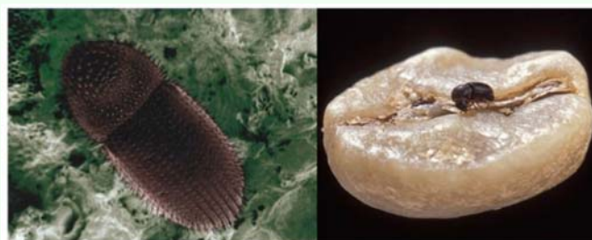
Figure 1. Dorsal view of an adult coffee berry borer, Hypothenemus hampei (left) and adult female (~ 2 mm long) walking over a coffee seed (right). High quality figures are available online.