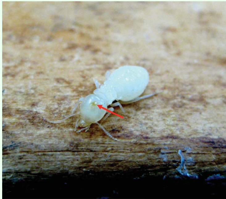
Figure 4. Parasitized Macrotermes carbonarius presoldier. A tiny dot (mouth hook of a larval parasitoid) can be seen inside the head capsule of the pre-soldier. High quality figures are available online.

were parasitized. However, none of the mature workers or L3 and L4 stages was parasitized.