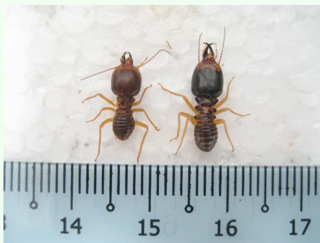
Figure 1. Macrotermes carbonarius soldier. Left: parasitized soldier; Right: healthy soldier, (Scale bar = 1.0 mm). High quality figures are available online.