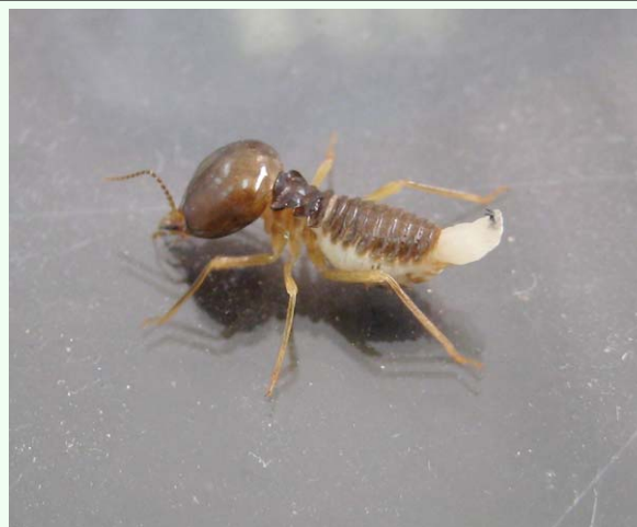
Figure 2. Larval parasitoid emergence posture in a parasitized soldier. High quality figures are available online.

days to develop to the adult stage under laboratory conditions. The fly was identified as V. fasciventris by Dr. H. Kurahashi (International Department of Dipterology, Tokyo, Japan).