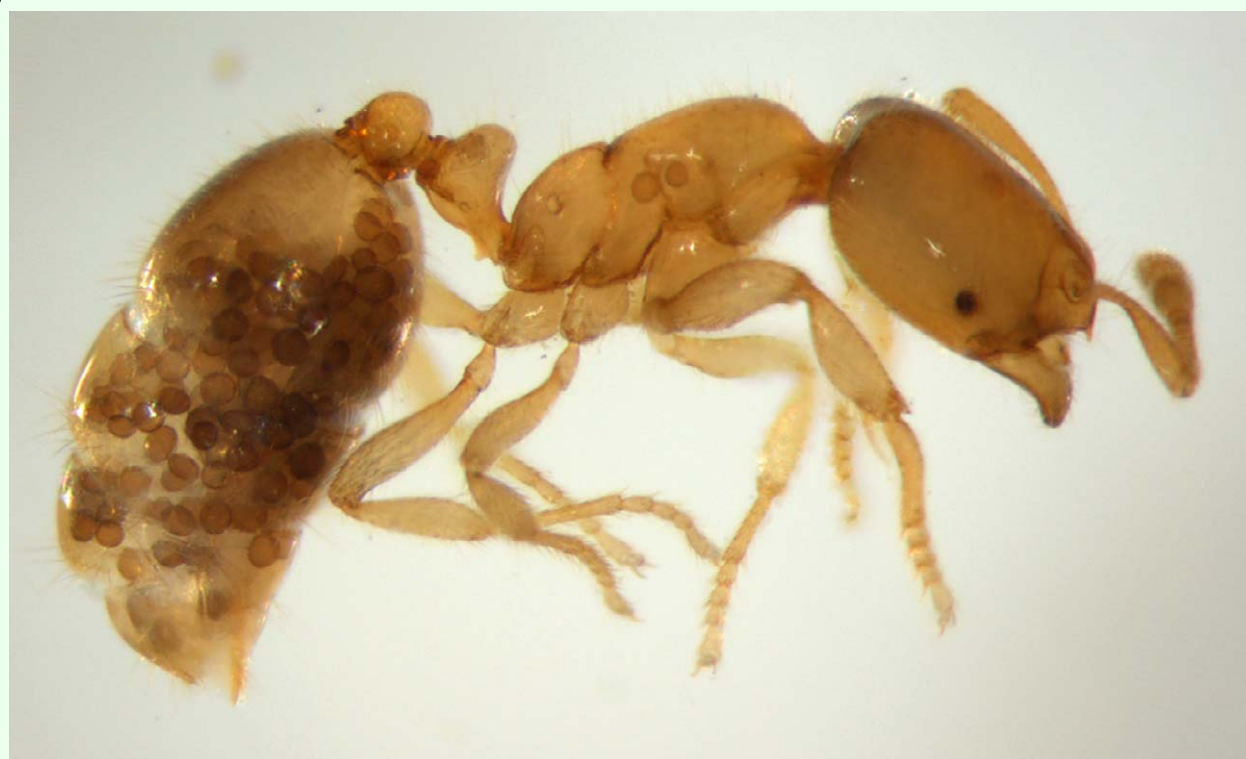
Figure 2. Mass of M. durum spores are visible in the gaster and the mesosoma of Solenopsis fugax worker collected in Czech Republic, near Mikulov at the end of August, 2010. High quality figures are available online.