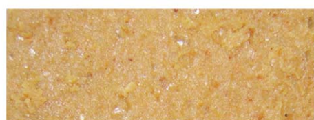
D. New artificial diet