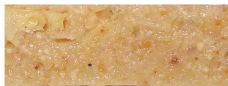
B. Diet reported by Onyango &amp; Ochieng'-Odero (1993)