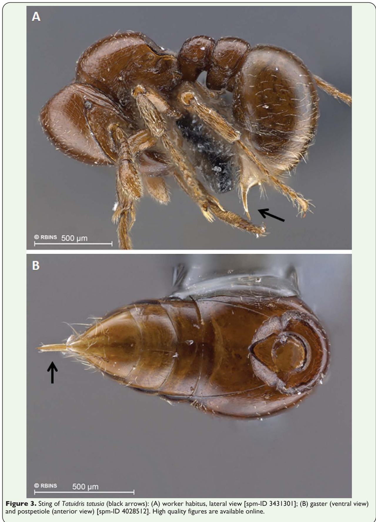
Figure 3. Sting of Tatuidris tatusia (black arrows): (A) worker habitus, lateral view [spm-ID 3431301]; (B) gaster (ventral view) and postpetiole (anterior view) [spm-ID 4028512]. High quality figures are available online.