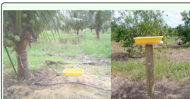
Figure 1. Yellow pan traps installed in the culture of Cocos nucifera on a plastic tube at a height of 0.2 meters above ground level (at left) and in the culture of Citrus spp. placed on wooden stakes at a height of 1.20 meters above ground level (at right). High quality figures are available online.

In each area cultivated with P. guajava , C. papaya , and Citrus spp., 10 traps were installed. These traps were placed on wooden stakes at a height of 1.2 m above ground level (Figure 1), spaced 25 meters from one another alternately in three rows. The collection and exchange of the trap solution was made weekly during 54 weeks, from June 2010 to July 2011.