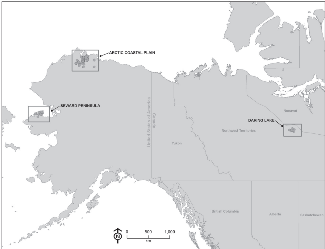
Figure 1. Study sites for sample collection in Yellow-billed Loons, 2002 to 2012.

(Earnst et al. (2005). The landscape is composed of a continuous permafrost environment, with a shallow active layer under tundra plant communities (< 1 m) and somewhat deeper active layers (taliks) underneath lakes. Unlike boreal forest areas, such as those within interior Alaska, where discontinuities in permafrost allow deep subsurface flow and connectivity, the shallow active layers of the ACP and the impermeability of the permafrost trap labile water near or at the surface. Thus, despite the ACP receiving relatively minimal annual precipitation (15-25 cm/year), it is replete with many small and large lakes (> 100,000), as well as highly saturated soils in many plant communities (Walker et al. 2005).