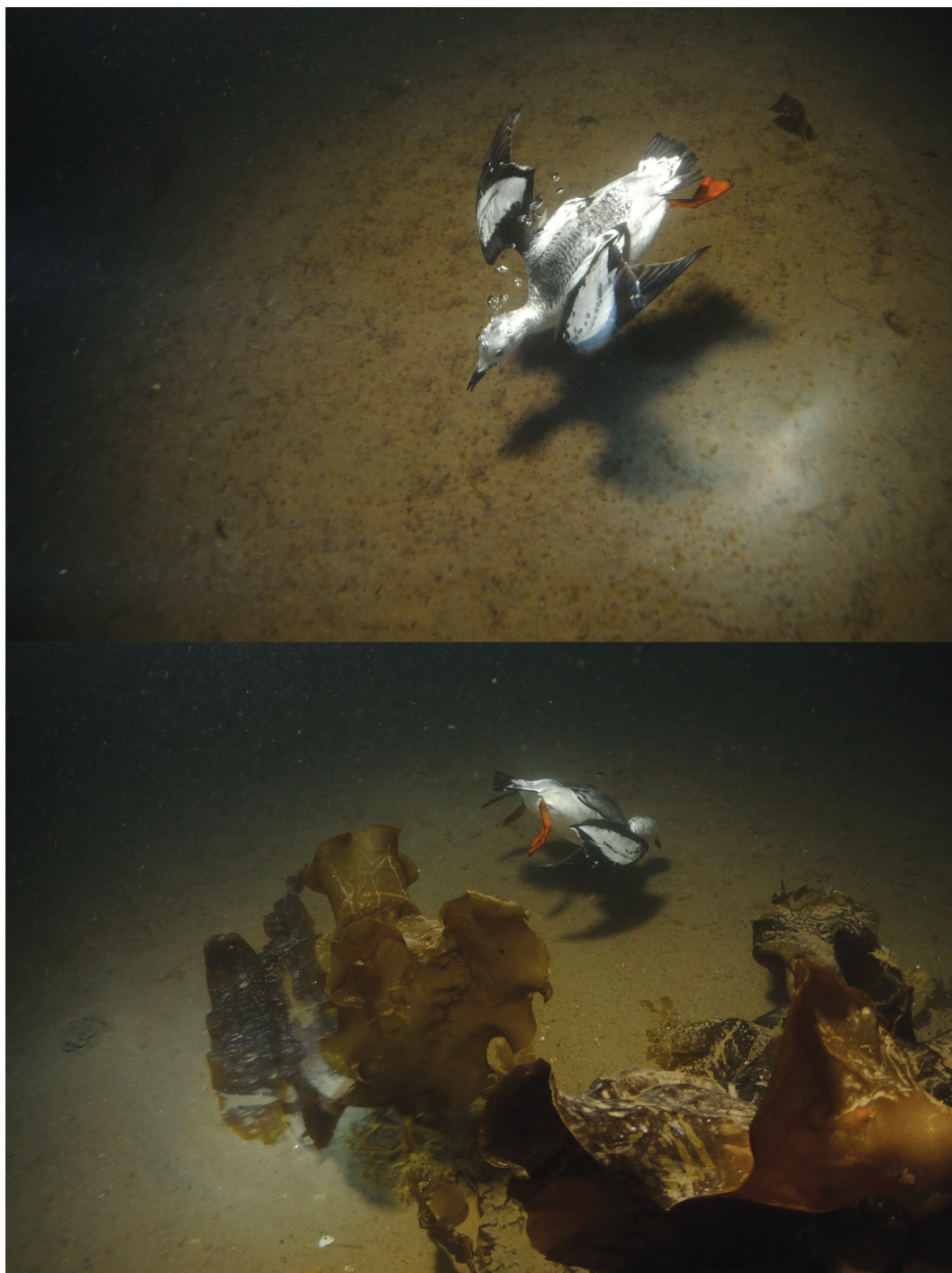
Figure 2. Actively feeding juvenile Black Guillemot in the beam of a diver's lamp in January 2015 in the Ny-Ålesund harbor on Spitsbergen Island, Svalbard Archipelago, Norway. The same individual is shown on both photographs.