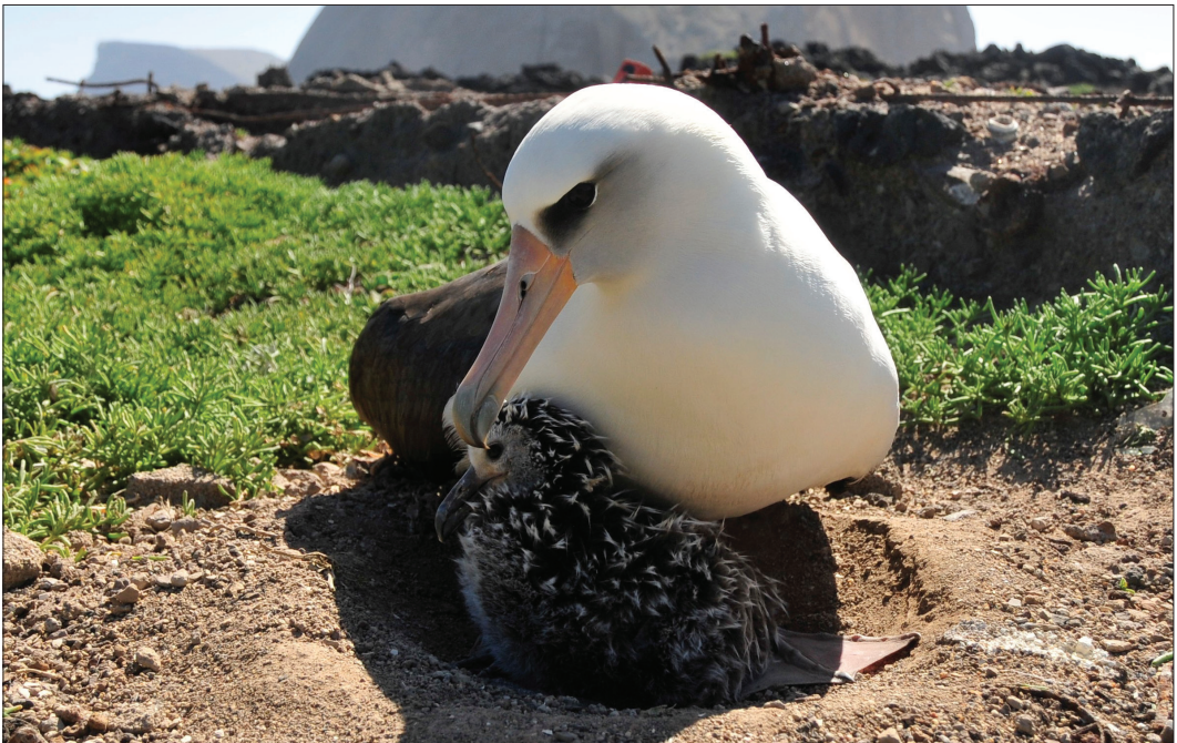
Frontispiece. The islands and archipelagos of northwestern Mexico are critically important for the conservation of many seabird species, such as: Top Left – Yellow-footed Gull ( Larus livens ), which breeds only in the Gulf of California; Top Right – Black-vented Shearwater ( Puffinus opisthomelas ), of which 95% of the global population breeds on Natividad Island; Bottom – Laysan Albatross ( Phoebastria immutabilis ) pictured here on Guadalupe Island, but it also nests farther south in the species only subtropical breeding colony in the world on the Revillagigedo Archipelago.