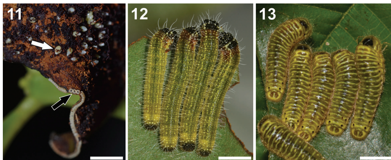
Figs. 11–13. Interspecific interaction between mistletoe butterflies on Phoradendron sp., from Jundiai, São Paulo, Southeast Brazil. 11 , egg clusters of Archonias brassolis tereas (white arrow) and Brangas sp. (black arrow) on the same leaf; note the feces of Brangas sp. partially covering the eggs. 12 , fourth instar larvae of Archonias brassolis tereas . 13 , last instar larvae of an undescribed Brangas . Scales = 0.4 cm.

short setae, inserted in panicula. The pupae are similar to those of some Catasticta species, such as Catasticta ctemene (Hewitson), Catasticta flisa (Herrich-Schäffer), Catasticta hegemon Godman & Salvin, Catasticta sisamnus (Fabricius), with a long anterior bifurcated projection, spine-like projections in the body, and black markings over a bright colored background. In contrast, the pupa of Archonias differ from Catasticta cerberus Godman & Salvin and Catasticta teutila (Doubleday), which have short projections and bird dropping aspect. Morphological and behavioral evidence from the immature stages described herein supports the close phylogenetic relationship between Catasticta and Archonias previously suggested based on molecular data (Braby et al. 2006, Wahlberg et al. 2014). The nomenclatural history and classification of Catasticta , however, is complex, and the genus is probably paraphyletic (see Lamas & Bollino 2004, Braby & Nishida 2010). In this way, the new data on Archonias immature stages can be of help in the understanding of character evolution and in the systematics of the group.