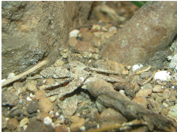
FIG. 8. Phereoeca praecox larvae feeding on feces from Aruba Island rattlesnake ( Crotalus unicolor ) in exhibit in the Aquarium Reptile Complex at Riverbanks Zoo and Garden.

We collected larval and adult P. praecox specimens from two separate locations in South Carolina, representing the first documented occurrences of this species in the state. We collected a single larval specimen from the wall in the bathroom of a private residence in Florence County, South Carolina, USA in April 2014 near Second Loop Road and Poinsett Drive (34°09'58" N, 79°47'07" W). We also collected several larval and adult specimens for examination from exhibits and a service area in the climate-controlled Aquarium Reptile Complex at the Riverbanks Zoo and Garden in Richland County, South Carolina in August and November 2016 respectively (34°00'37" N, 81°04'27" W), where a breeding population has been established for at least seven years. We collected all specimens by hand and preserved them in 95% ethanol. We identified specimens morphologically (e.g., Hinton 1956) and genetically using the barcoding region of the COI gene (Folmer et al. 1994, Hebert et al. 2003). We used four Riverbanks Zoo specimens for DNA analysis which all yielded an identical haplotype (Genbank Accession No.: KY575118) of 658 nucleotides. While P. praecox occurs in the western United States, these are the first documented findings of the moth in South Carolina, which expands the moth's known range in the United States.