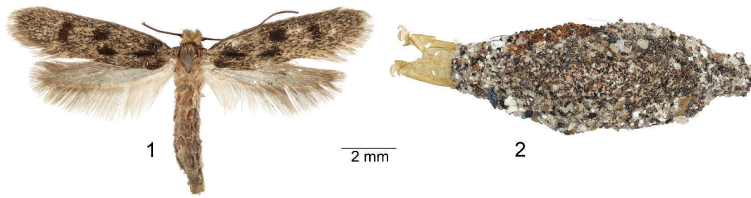
FIGS. 1–2. Pheroeca praecox . 1. (♀), Clairmont, San Diego County, California. Wingspan 12.8 mm. 2. Larval case of adult in Figure 1. Length of case 10 mm.