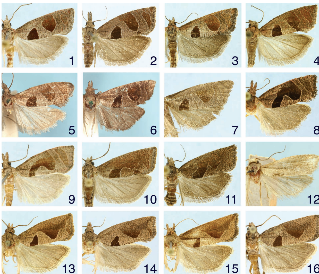
FIGS. 1–16. 1–7, E. dorsisignatana . 1, ♂, Adams Co., Ohio. 2, ♀, Ithaca, New York. 3, ♂, Larimer Co., Colorado. 4, ♂, Halifax, Nova Scotia. 5, P. clavana lectotype. 6, C. distigmata holotype. 7, E. d. diffusana lectotype. 8–9, E. similiana , form confluana . 8, ♀, Hamilton Co., Ohio. 9, ♂, Susquehanna Co., Pennsylvania. 10–11, E. similiana , form diffusana , ♂, ♂, Hamilton Co., Ohio. 12, E. engelana , lectotype. 13–16, E. oraria . 13, Holotype. 14, ♀, Accomack Co., Virginia. 15, ♀, Northampton Co., Virginia. 16, ♂, Worcester Co., Maryland.