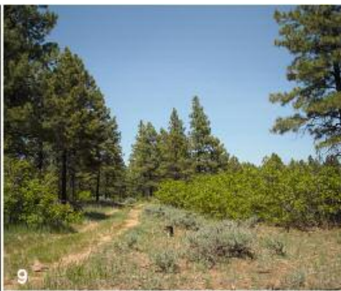
FIG. 9. Type locality habitat, San Juan Co., Utah.

Discussion. Based upon the male genitalia, Antaeotricha utahensis is closest to A. fuscocrectangulata (adult forewings heavily maculated), but the tegumen is not produced into a dorsally projecting process in front; the aedeagus is shorter and broader with a different complement of cornuti. The female genitalia are closest to A. thomasi , but the signum in A. thomasi is a cross with a projecting element. In A. thomasi , the ductus seminalis originates from the midpoint of the ductus bursae, while it originates from the upper quadrant of the corpus bursae in A. utahensis .