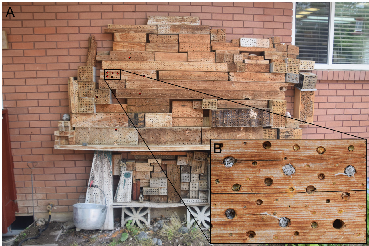
Fig. 1. Trap nests where use of plastic for nesting by Isodontia elegans took place. A. The trap nests set up in FDP's backyard, with the ten plastic fiber nests marked in red. B. Close-up view of a nest closure made with plastic fibers.

a wide variety of vegetables and flowering trees that house all manner of insects. A series of trap nests of highly variable sizes in irregular formation is also present (Fig. 1A), ranging in diameter from 2 mm to over 1 cm and numbering well into the hundreds. Over a period of about two weeks inclusive of July 23–26, 2021, at least two females of Isodontia elegans were observed provisioning nests in ~9 mm diameter trap nest holes with what seemed to be exclusively Oecanthus fultoni Walker (Orthoptera: Gryllidae), then sealing the nests with an unusual plastic material, sometimes forming apical brooms as they normally do with grass (Fig. 1B, Supplementary Video 1). The source of the material was discovered directly over the fence of FDP's backyard, roughly 7 m from the nests, and identified as a green, friable bag made of interwoven plastic fibers used to house and carry various heavy building materials (possibly sought because very little grass was present in the backyard of FDP). In total, ten nests were provisioned in 2021 (Fig. 1A), only one of which had some grass visible in the closure. The site was visited by both authors for imaging in mid-June 2022, but no wasp activity was evident. Based on the partial excavation of one