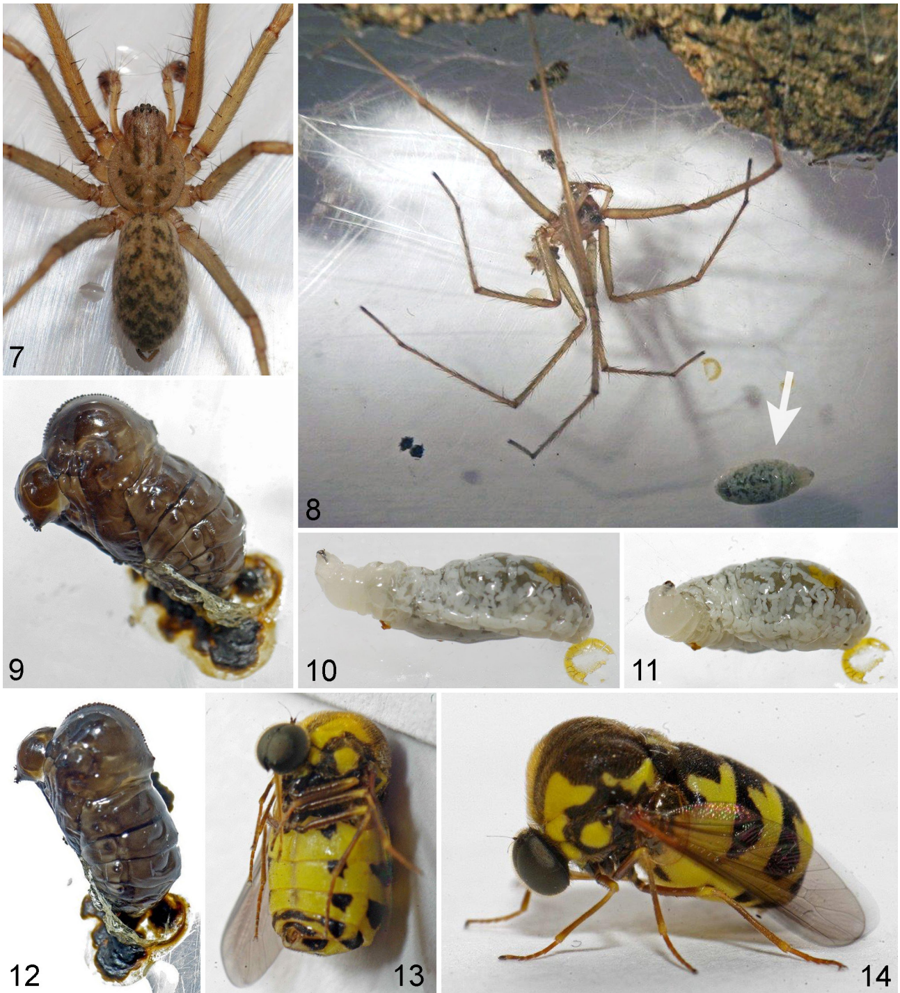
Figs. 7–14. Cyrtus gibbus (Fabricius, 1794) reared from male Eratigena sp. from Spain. 7. Eratigena sp. in dorsal view. 8. Eratigena sp. in lateral view and C. gibbus larva (indicated by arrow) in dorsal view. 9. C. gibbus pupa in lateral view. 10–11. C. gibbus larva in lateral view. 12. C. gibbus pupa in dorsolateral view. 13. C. gibbus adult in ventrolateral view. 14. C. gibbus adult in lateral view.