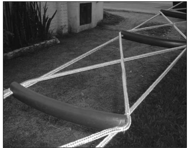
Figure 4. String bridge, 'ship ladder' model, before being installed in Lami, Porto Alegre. (Photo by L. X. Lokschin).