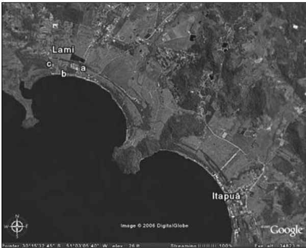
Figure 2. Southernmost area of Porto Alegre, and the neighboring city of Viamão, Itapua district. a, b and c are critical points where bridges for howler monkeys were installed in Lami, Porto Alegre, RS, Brazil.

dition to insulation, the three low tension cables must be braided forming only one cable, thereafter reducing the possibility of animal use. Since the first bridge was installed and critical areas were isolated accidents have become rare. One accident was recorded in 2005 in an already insulated area, which had its terminal poles exposed. Since then, the CEEE arranged to insulate all terminals. In 2006, another howler was hurt on high tension cables, in an area already requested to be insulated. The CEEE does not have a way to isolate this type of cables, so pruning was requested. These two last cases suggest that prioritized areas are actually being used by howlers and that they are exposed to danger. If cables are not insulated, they offer potential risks to the animals. Nowadays, to reduce accidents, CEEE has taken the responsibility for keeping cables insulated and trees cut. This legal decision in favor of wild animals was the first one in the country and might set a precedent in Environmental