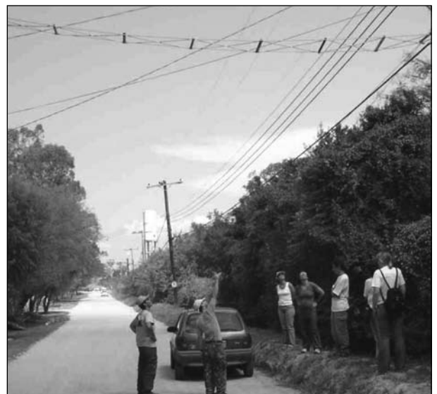
Figure 5. String bridge where howlers were seen crossing between forest fragments at Lami, Porto Alegre. (Photo by G. Buss).