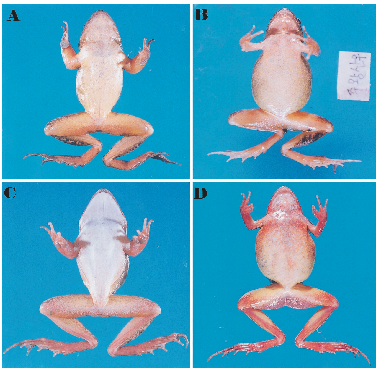
Fig. 2. Ventral views of Rana huanrenensis (A and B) and R. dybowskii (C and D) from South Korea in breeding season showing the grayish-yellow throat and chest of male R. huanrenensis (A) compared to the milky-white throat and chest of male R. dybowskii (C) and the greenish-yellow throat and chest of female R. huanrenensis (B) compared to the reddish-yellow throat and chest of female R. dybowskii (D).

Morphology —Intraspecific morphological variation was much less notable than interspecific one. Rana huanren-