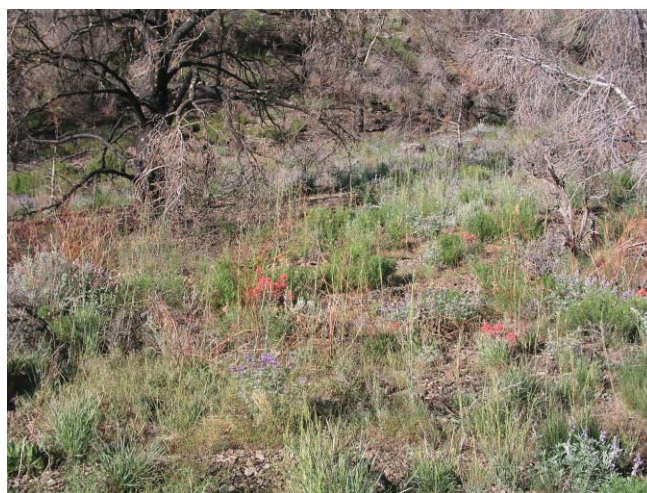
Recovery of sagebrush steppe following prescribed fire.

understanding of the effects of different management approaches, like biocontrol agents and prescribed or managed fire, is needed to effectively manage both wildfire and invasive species. For example, in pinyon–juniper ecosystems, it is necessary to identify methods for managing expansion that promote native recovery rather than conversion to an undesired state.