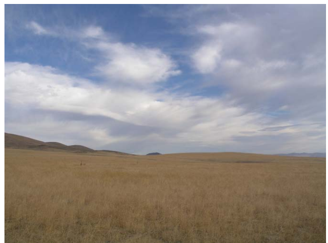
Sagebrush steppe converted to cheatgrass ( Bromus tectorum ).