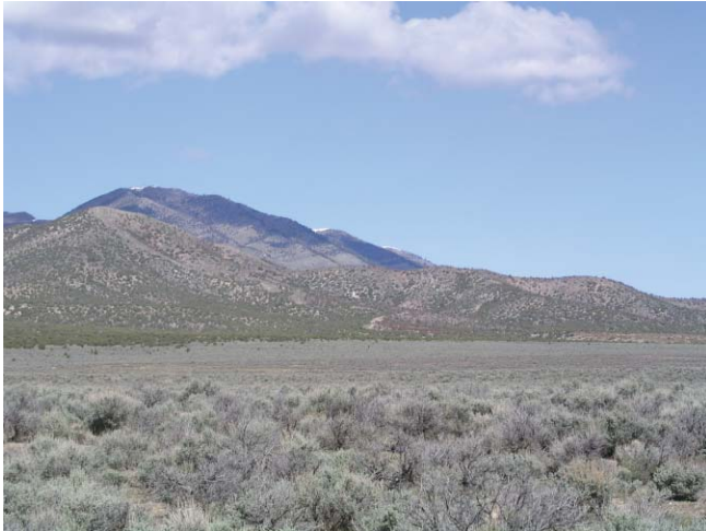
Sagebrush steppe and pinyon-juniper woodland.

fuel abundance and continuity. Consequently, fire frequency was higher in sagebrush types with greater productivity and during periods of increased precipitation. 2,7 More locally within sagebrush types, fire return intervals in sagebrush shrublands were likely determined by topographic and soil effects on productivity and fuels, and were also highly variable. 8 Salt-desert shrublands and desert scrub rarely if ever burned due to inherently low productivity and fuels loads. 9