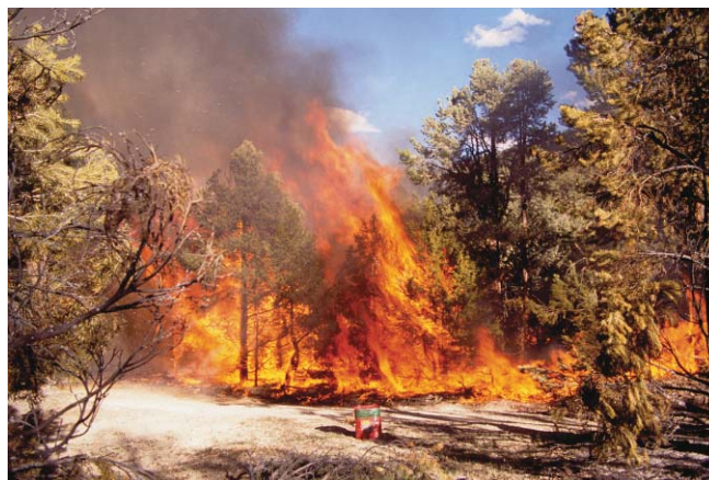
Use of prescribed fire in pinyon–juniper woodland.

The probability that a given shrubland will transition to woodlands, to nonnative annual grasses, or both is linked to three ecological concepts: ecological resistance, ecological resilience, and thresholds. 20 Ecological resistance is the degree to which a community maintains itself over time despite the introduction of invasive species. Ecological resilience describes the ability of a community to return to its predisturbance and, presumably, its pre-invasion state after a disturbance. Threshold crossings occur when a community does not return to the original state via natural processes following disturbance, but requires active management to restore the original state. 21,22 Research and management projects aimed at understanding the factors that influence ecosystem resistance to invasive species and resilience after fire and other types of disturbance are needed both to prioritize areas for restoration and other management activities, and to develop effective treatments for different types of ecosystems. 20 Defining the specific soil characteristics, vegetation composition, and abundance of different ecological types that are likely to result in recovery versus threshold crossings can be used to refine restoration and other management strategies. Further, increasing our