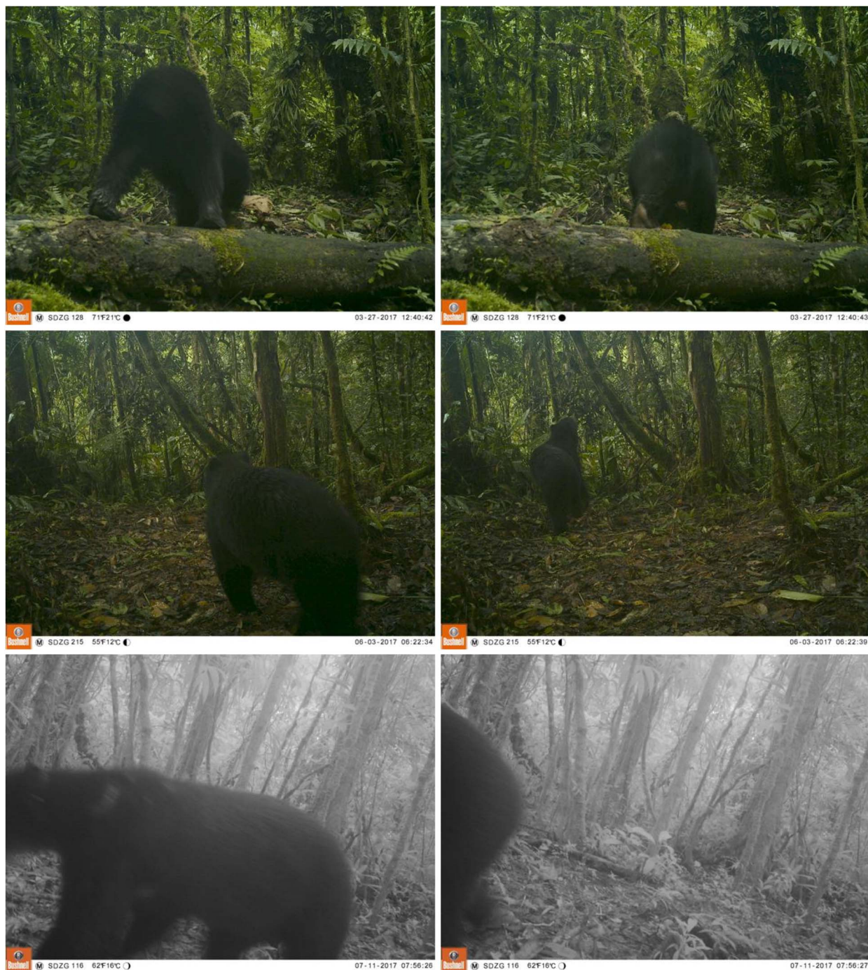
Fig. 2. Sample photos from 3 detections of \geq 1 Andean bear ( Tremarctos ornatus ) during 2017 in the Haramba Queros Wachiperi Ecological Reserve Conservation Concession (Cusco, Peru). Each row includes 2 images from the same detection. From top to bottom, detections were located at 811 m above sea level (masl), 920 masl, and 830 masl.