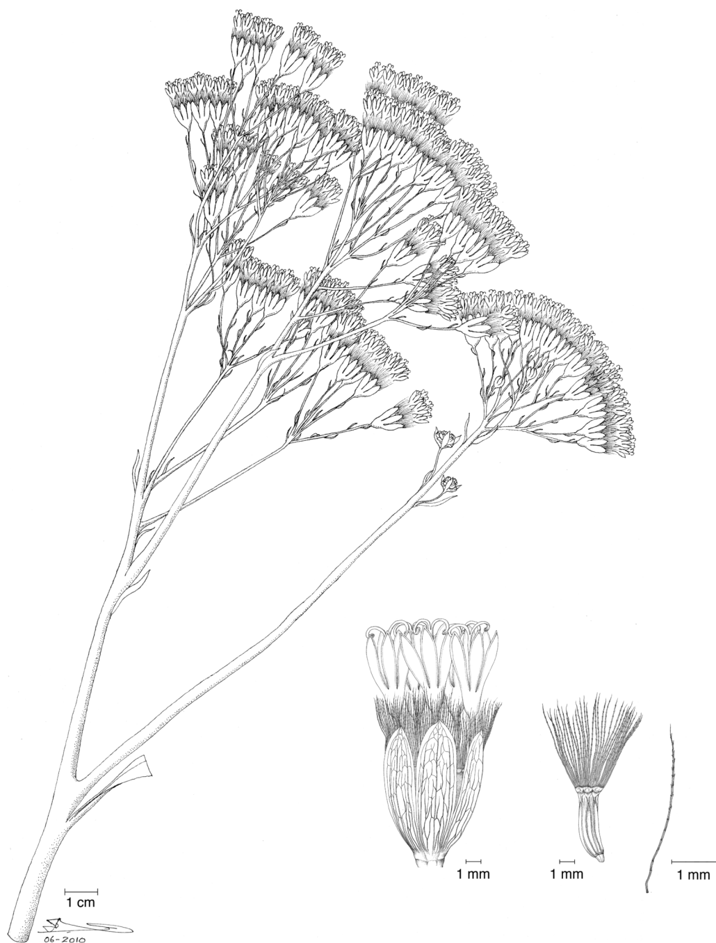
FIG. 2. Habit, capitula, achene, and pappus bristle of Psacalium putlanum (drawn from holotype).