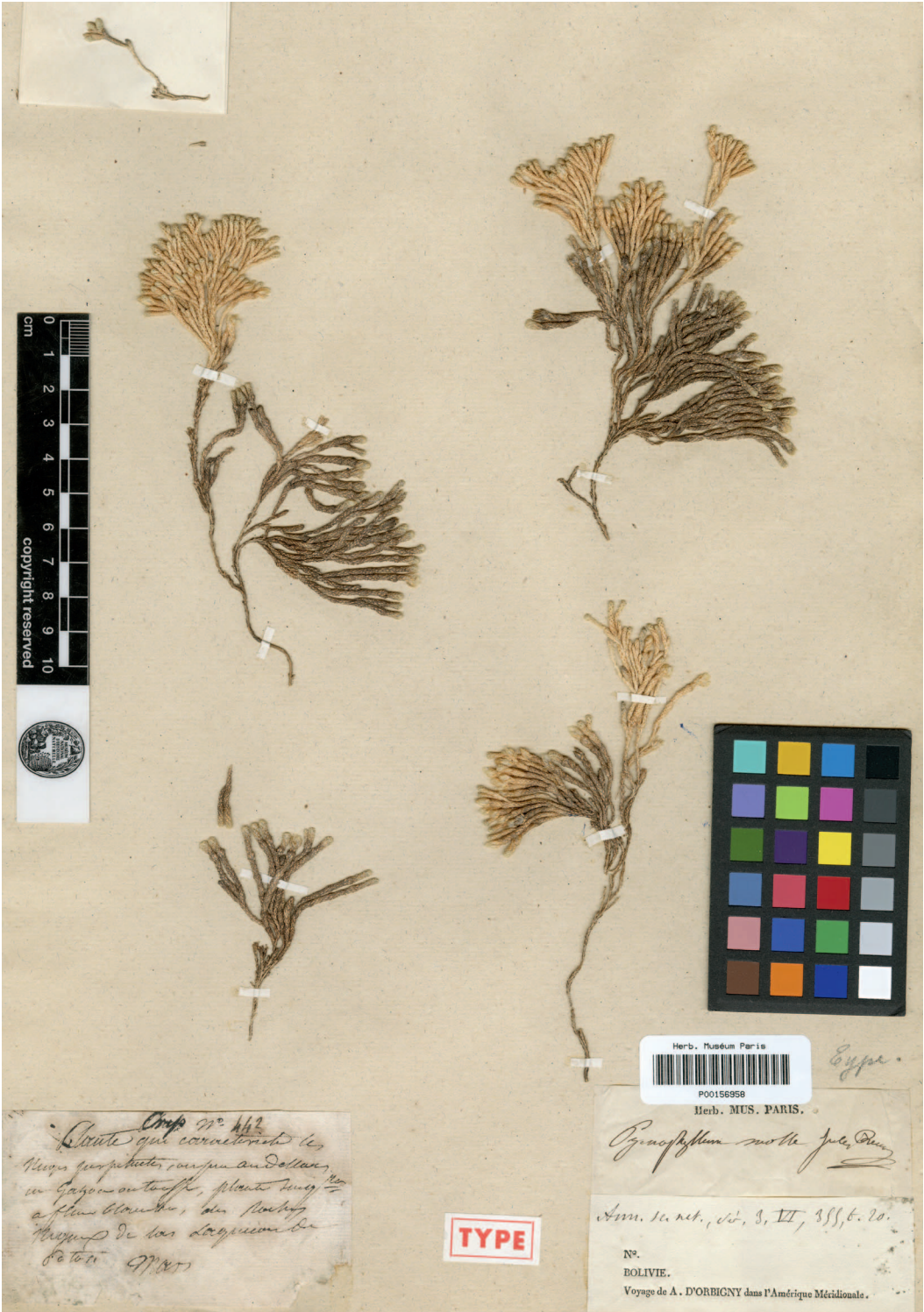
FIG. 3. Lectotype (P 00156958) of Pycnophyllum molle .