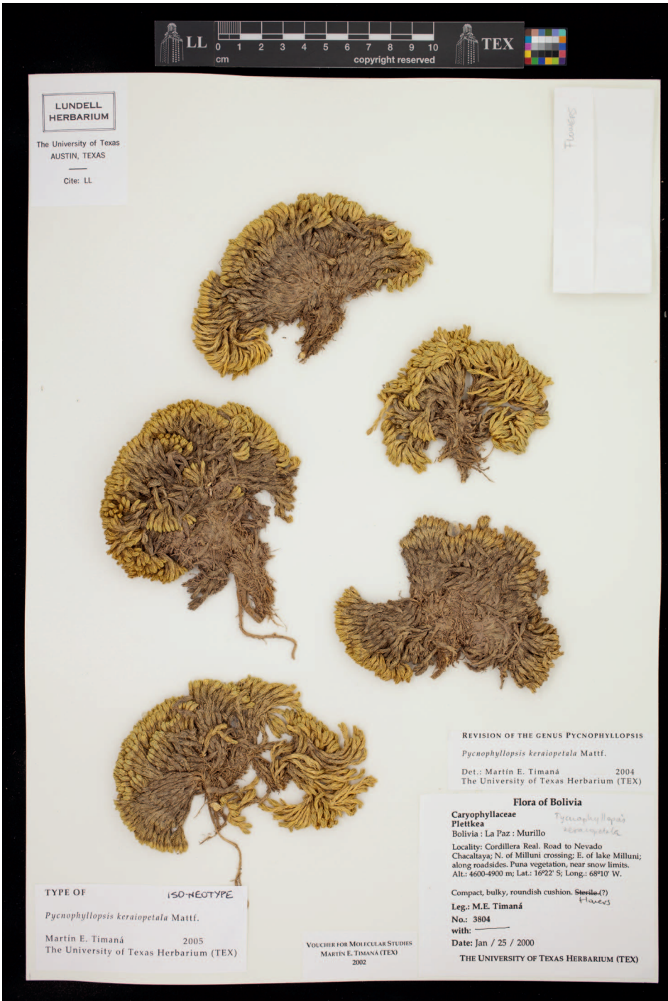
FIG. 1. Isonotype of Pycnophyllopsis keraipetala . —The University of Texas Herbarium (LL).