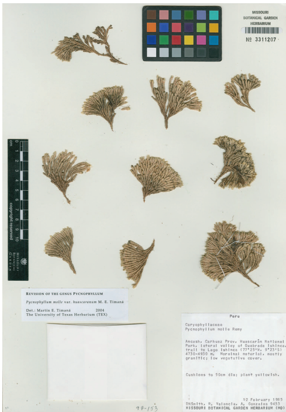
FIG. 4. Holotype (MO 3311207) of Pycnophyllum huascarum .