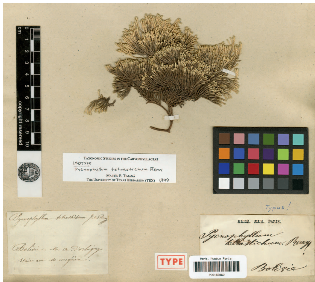
FIG. 5. Lectotype (P 00156960) of Pycnophyllum tetrastichum .

designated here: MOL!; ISOLECTOTYPES: G!, US!).