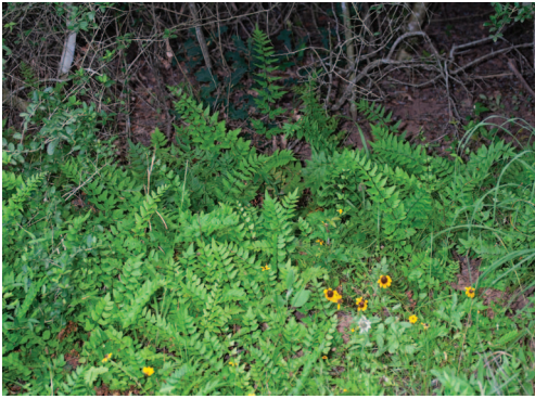
FIG. 1. Portion of a large colony of Cheilanthes viridis growing at edge of grove of Ilex vomitoria , with grasses, Rudbeckia , and Monarda ; Bastrop County, Texas.

in cultivation in gardens or greenhouses. The earliest voucher to document Cheilanthes viridis growing spontaneously dates to 1985 from Georgia. Other reports are all more recent and likely represent independent escapes. The oldest herbarium specimens representing plants in the wild include: South Carolina, 1992; Florida, 1999, Texas, 2019; and Louisiana, 2020. Thus far, specimens from outside of cultivation have only been collected in these five states. Botanists in other southeastern states, as well as in southern California, should be on the lookout for additional naturalized populations. The species was treated for Florida by Wunderlin and Hansen (2000), who did not cite specimens or comment that this represented the first report of the taxon for North America. The Georgia occurrence was included by Weakley (2012) in his regional floristic treatment of southeastern states.