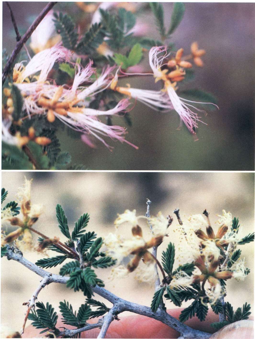
FIG. 4. Above, Calliandra eriophylla (Turner 20-394). Below, Calliandra isleyi (holotype).