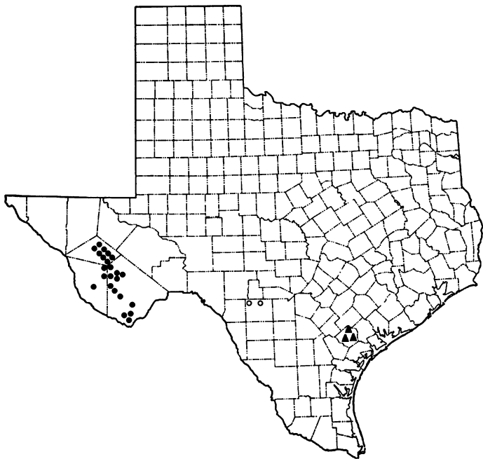
FIG. 1. Distribution of Calliandra biflora (triangles), C. eriophylla (open circles), C. humilis (closed circles) in Texas.