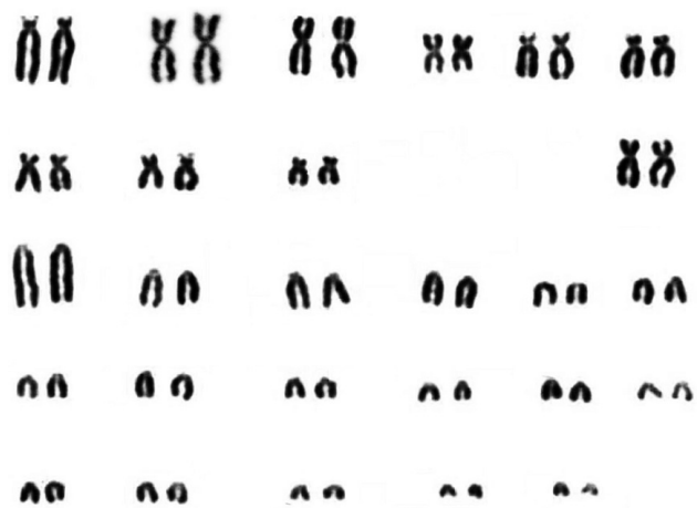
Fig. 2. Karyotype of a female of 2n = 54S cytotype from Saimbeyli.

Two new cytotypes of Nannospalax xanthodon with