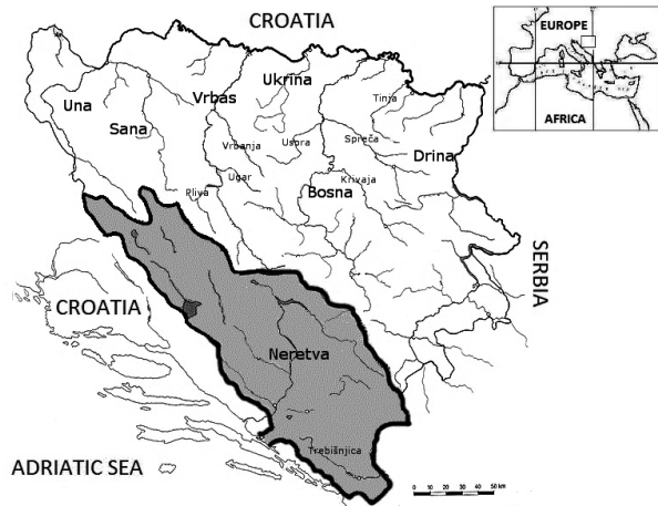
Fig. 1. Map of Bosnia and Herzegovina showing main catchments, Danube (or Black Sea) catchment (unshaded) and Adriatic Sea catchment (shaded).

distribution are very scarce, mostly based on species lists only lacking detailed descriptions of species and localities. According to the bibliographic data, a total of nine species of loach (eight Cobitidae and one Nemacheilidae) were reported from freshwaters within their geographical range (Vuković 1963, 1977, Bogut et al. 2006, Šanda et al. 2008a, b, Sofradžija 2009, Buj et al. 2014, 2015a, b, Golub et al. 2016). However, some of the data are in obvious conflict with the current taxonomy. Based on all available data it is clear that reports on the presence of Cobitis taenia Linnaeus, 1758 in Bosnia and Herzegovina are a result of taxonomic imprecision and it cannot be expected that this species inhabits waters of Bosnia and Herzegovina, because its distribution range is restricted to northern Europe (Nalbant et al. 2001). Bosnia and Herzegovina was thought to be a part of this species' range since C. taenia was considered to have extremely wide distribution through Palearctic region (Nalbant et al. 2001). However, already Bacescu (1962) reported C. taenia to be an assemblage of morphologically similar, but phylogenetically distinct species.