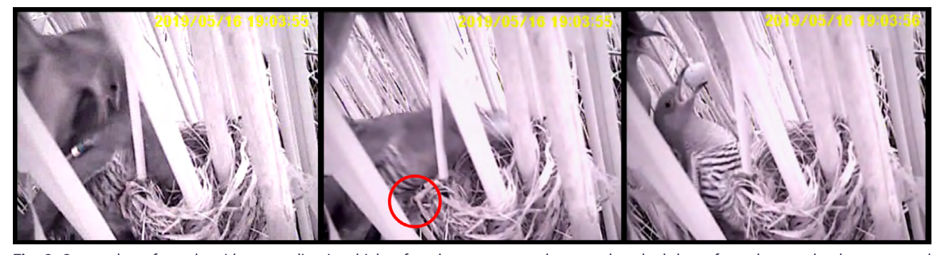
Fig. 2. Screenshots from the video-recording in which a female common cuckoo was knocked down from the nest by the great reed warbler female. The nest contained three host eggs and the cuckoo removed one of them during the attacks by the host female. The female cuckoo did not lay her own egg. The second frame shows that the cuckoo had a ring on her right tarsus (in the red circle). For the whole video, see supplementary online material.