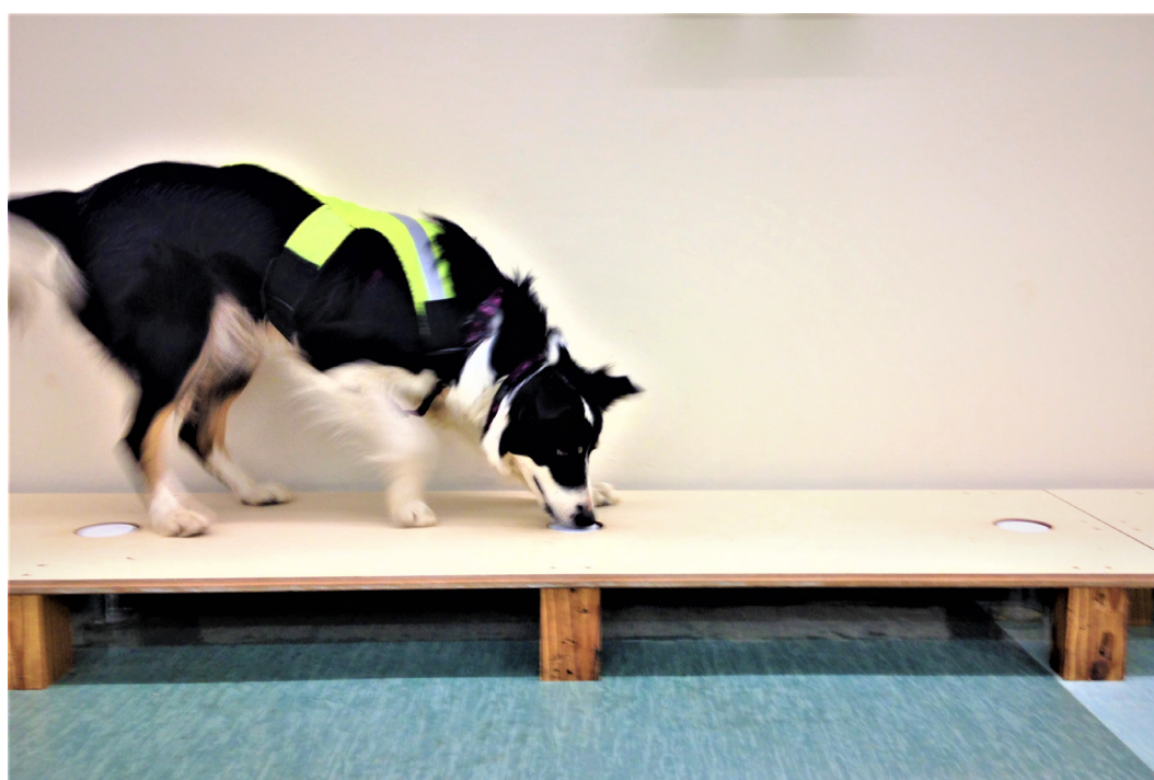
Fig. 2. Platform indicating how containers with breathable lids were placed below the surface and how the platform was used by the detection dog for operant conditioning and during tests.

A raised platform (used as a training aid) with evenly spaced, 6 cm diameter holes was used to create a “false bottom”. The platform allowed 10 spaces for positive- and negative targets to be concealed in containers below the work surface